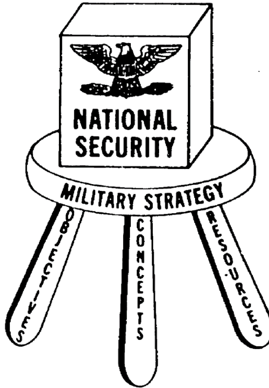
Figure 3. Lykke's Model for Military Strategy

Source: Arthur F. Lykke, Jr., "Towards a Theory of Military Strategy," in Military Strategy, Theory and Application: A Reference Text for the U.S. Army War College , 5th ed., ed. Arthur f. Lykke, Jr. (Carlisle Barracks, PA: U.S. Army War College, 1989), 6.