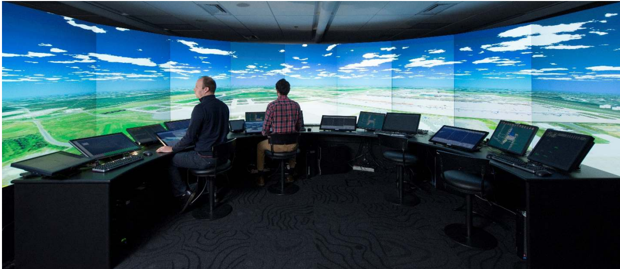
Figure 2: Picture of the Tower environment in the IDEA Lab.

Working in the IDEA Lab together with the Federal Aviation Administration, National Air Traffic Controllers Association, Air Line Pilots Association, civil aviation authorities of various countries, and other organizations, MITRE has helped improve aerospace systems in a number of key areas, such as airspace redesign, controller training prototypes, airport/runway siting, and incorporating UAS into the NAS.