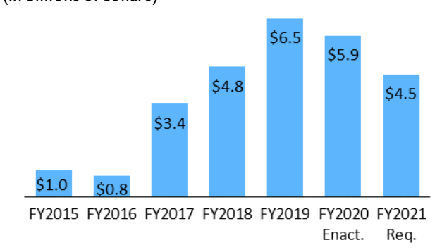
Figure 1. EDI Budget FY2015-FY2021 (In billions of dollars)