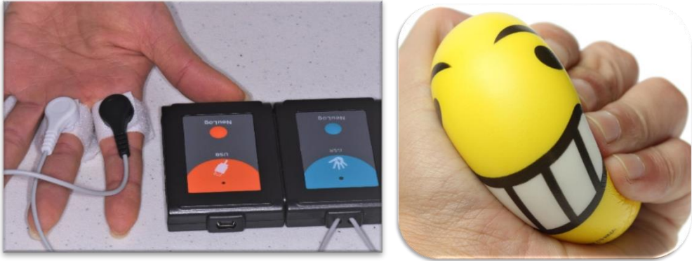
Figure 4: Data was collected using NeuLog 3 GSR software with a one-hour run time and a sampling frequency of 5 microsiemens ( \mu\text{S} ) per second.