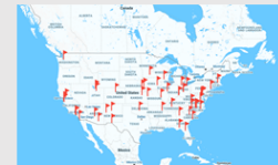
Participating Technology Transfer Offices