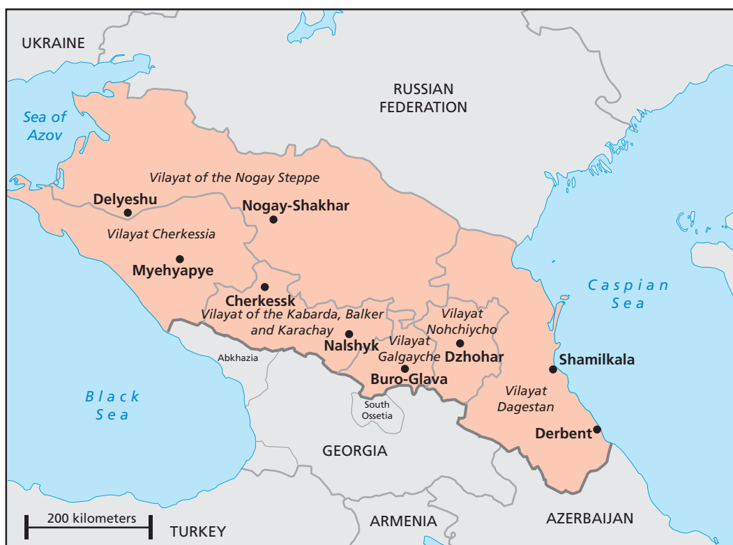
Figure 3.3 Republics Included in the Illegally Proclaimed Caucasus Emirate