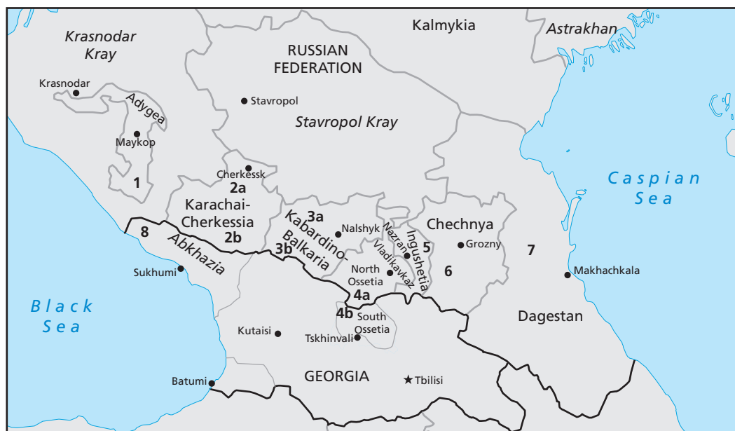
Figure 3.1 The North Caucasus

NOTE: The northwest Caucasus region encompasses Adygea (1), Karachai-Cherkessia (2ab); Kabardino-Balkaria (3ab), and North Ossetia (4a). The northeast Caucasus region encompasses Ingushetia (5), Chechnya (6), and Dagestan (7). There are also two South Caucasus regions: South Ossetia (4b) and Abkhazia (8), which are culturally and politically connected to the northwest Caucasus.