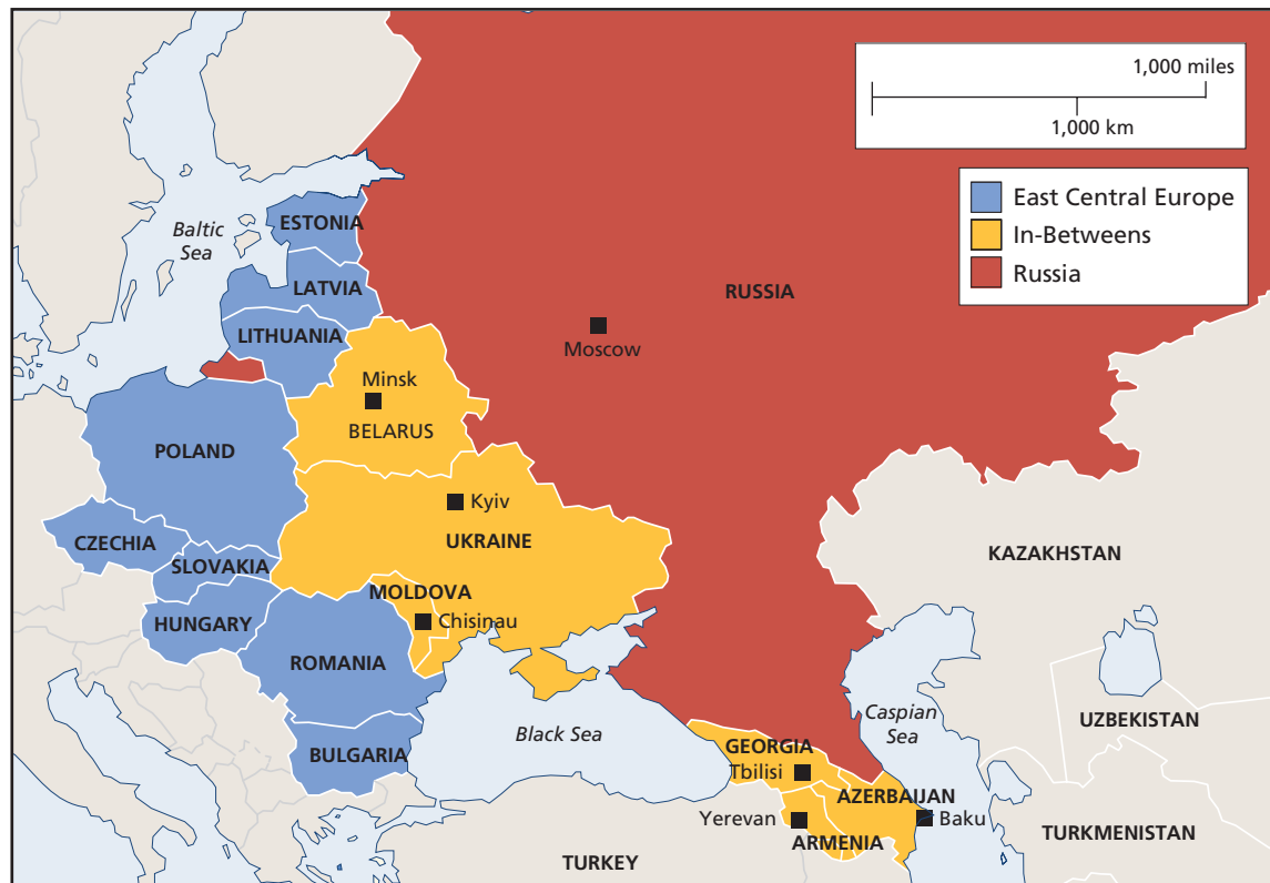
Figure 1.1 The State of the Region