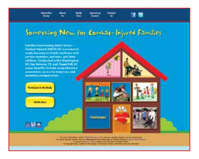
The website home page and portal to the Families OverComing Under Stress – Combat Injury (FOCUS-CI) study (www.cifamilies.org).

Families OverComing Under Stress - Combat Injury (FOCUS-CI) is a randomized controlled trial that tests the effectiveness of a newly developed family-centered, strength-based intervention for severely combat injured service members and their families. The FOCUS-CI intervention provides families support through integrated instruction, coaching and skill-building in the areas of emotion regulation, problem-solving, communication, and goal-setting. The study is conducted at Walter Reed National Military Medical Center (WRNMMC), San Antonio Army Medical Center (SAAMC), and is expand-