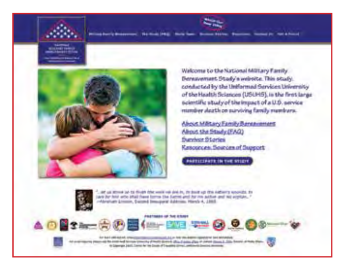
The website home page and portal to the National Military Family Bereavement Study (www. militarysurvivorstudy.org).

next three years, CSTS researchers will continue to work actively with researchers from other academic institutions, including Columbia University, Harvard University, University of Michigan, and the University of California, Los Angeles.