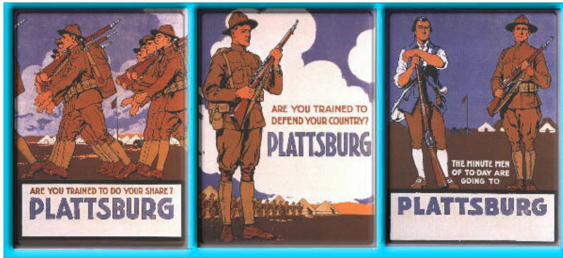
Figure 1. Plattsburg Posters

Source: Michael E. Hanlon, “The Plattsburg Movement Where General Pershing Found His Officers,” Roads to the Great War , last modified July 10, 2013, accessed May 1, 2018, http://roadstothegreatwar-ww1.blogspot.com/2013/07/where-did-general-pershing-find-all.html .