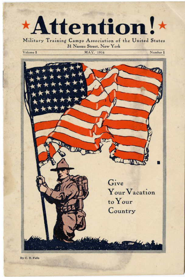
Figure 2. Military Training Camps Association Poster

class of northeastern businessmen, spread throughout the country. 114 Support for citizen military training was truly bipartisan.