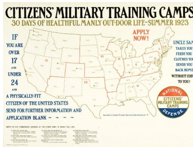
Figure 4. Citizen Military Training Camps Poster 2