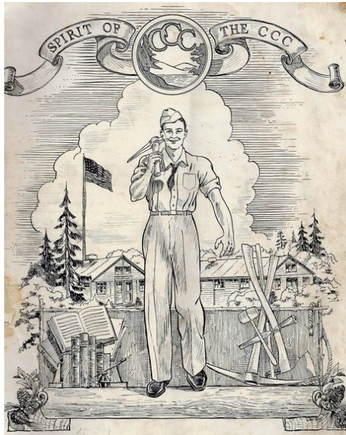
Figure 6. Civilian Conservation Corps Poster 2