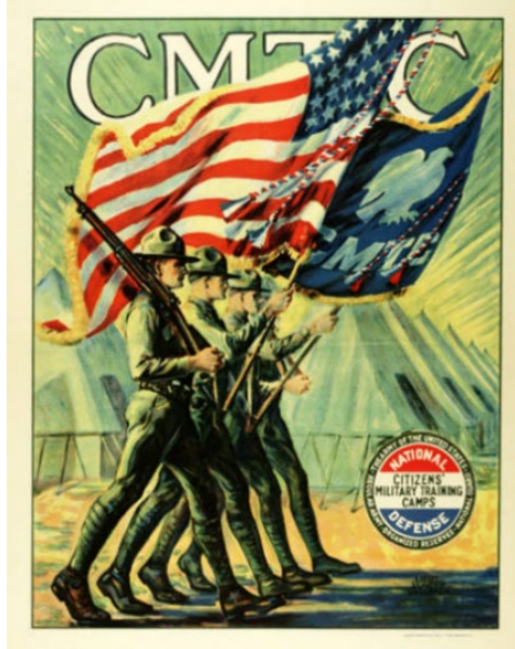
Figure 3. Citizen Military Training Camps Poster 1

Source: James P. Wharton, “CMTC Citizens’ Military Training Camps, National Defense,” Pritzker Military Museum and Library (Washington, DC: Engineering Reproduction Plant, 1939-1945), accessed March 17, 2018, https://www.pritzker military.org/explore/museum/digital-collection/view/oclc/798928873 .