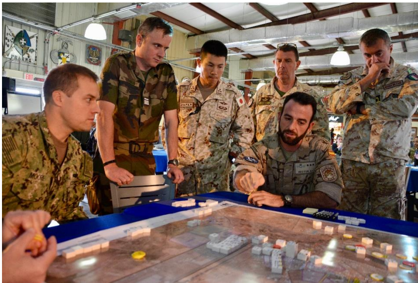
Figure 4. Multinational military representatives confer during ERIE