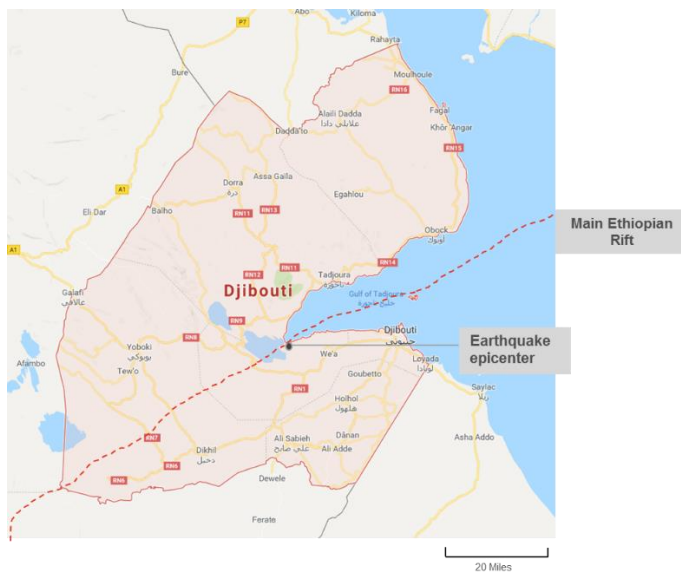
Figure 1. ERIE scenario earthquake