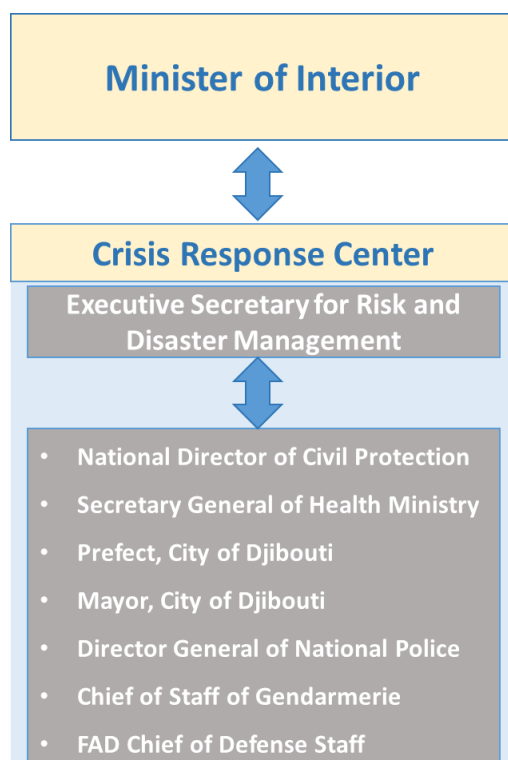
Figure 2. Government of Djibouti CRC structure