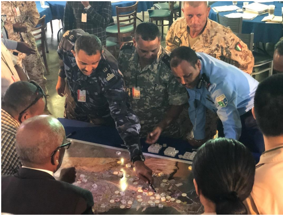
Figure 3. Government of Djibouti team placing their assets on the ERIE map of Djibouti City