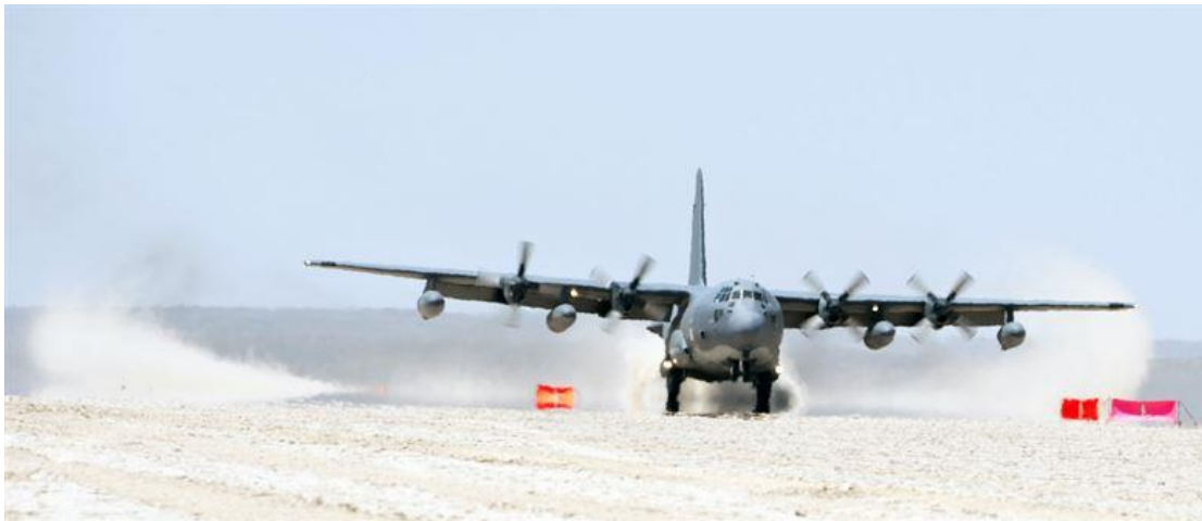
Figure 5. C-130 landing on the road in the Grand Bara desert