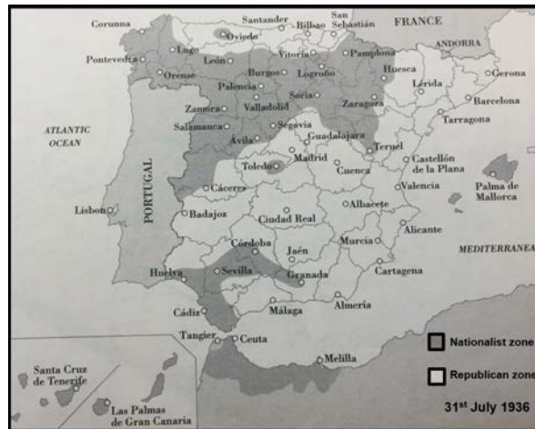
Figure 1. Territories under Nationalist and Republican Control Two Weeks after the Military Uprising. Antony Beevor, The Battle for Spain: The Spanish Civil War 1936-1939 (London: Penguin Books, 2006), xi.

General Franco's first decision of consequence took place a few months after the military uprising of July 1936. The initial intention of the generals who promoted the uprising, among whom was Franco, consisted of quickly conquering Madrid, through a series of concentric marches from several directions within Spain. However, the failure of the uprising in several of the regions from which those marches should have started and an unexpected resistance in others, broke the initial plan. 99