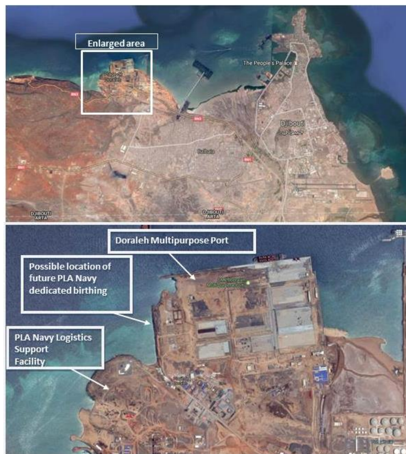
Figure 3. China's naval facility in Djibouti

Most of China's military logistics facilities in Djibouti are being built immediately southwest of the Doraleh Multipurpose Port (see Figure 3), although the PLA Navy will have one of the port berths dedicated exclusively for its use. It is expected to be completed in 2017, though the Chinese government has not officially provided any figures on the number of personnel that will be stationed there. The base is also unofficially reported to include storage for fuel, weapons, and equipment, and maintenance facilities for helicopters and for commercial and military ships. 98