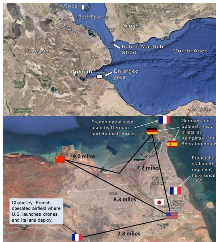
Figure 4. Foreign military facilities in Djibouti

See Appendix B for sources used to determine base locations.