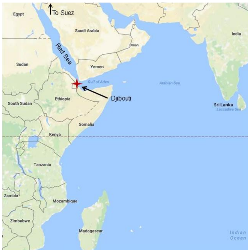
Figure 1. Djibouti's strategic location

investments in a variety of infrastructure projects, including port and transportation facilities, power generation and distribution, and water supply. 9 These projects are largely financed by foreign entities. 10