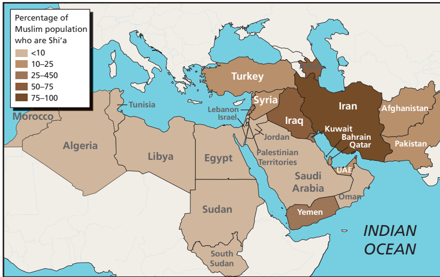
Figure 2.1 Shi'a and Sunni Populations in the Middle East