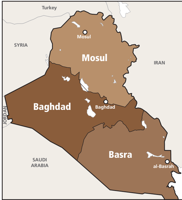
Figure 3.1 Ottoman Provinces of Iraq Pre-1916

sis because it undermines the argument that the Iraqi state is strictly a modern Western construct artificially stitching together people who would otherwise be naturally segregated by Islamic sect.