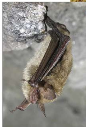
Northern long-eared bat ( Myotis septentrionalis )

Representative species from Fort Carson, CO and Camp Atterbury, IN, which have the highest estimated climate change exposure among installations estimated to have high climate change vulnerability