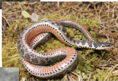
Kirtland's snake ( Clonophis kirtlandii )