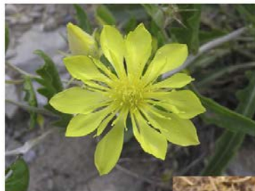
Golden blazing star ( Nuttallia chrysantha )