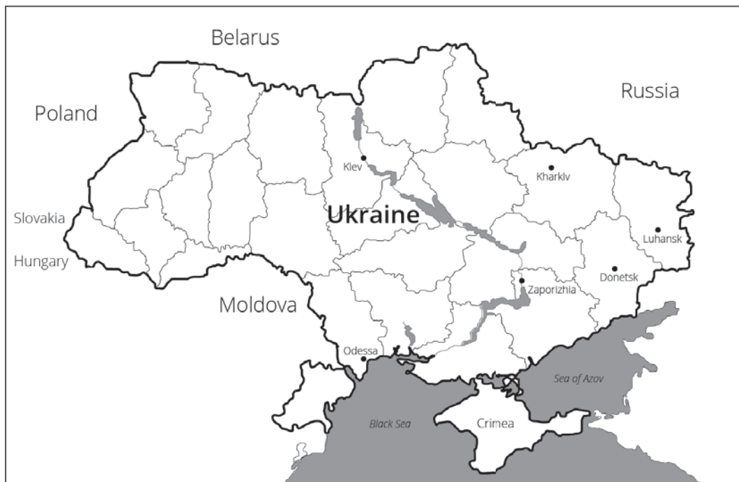
Map 1. Ukraine following Russia's 2014 annexation of Crimea

Although formally undefined, U.S. government professionals have used the term ambiguous warfare since at least the 1980s to refer to situations in which a state or