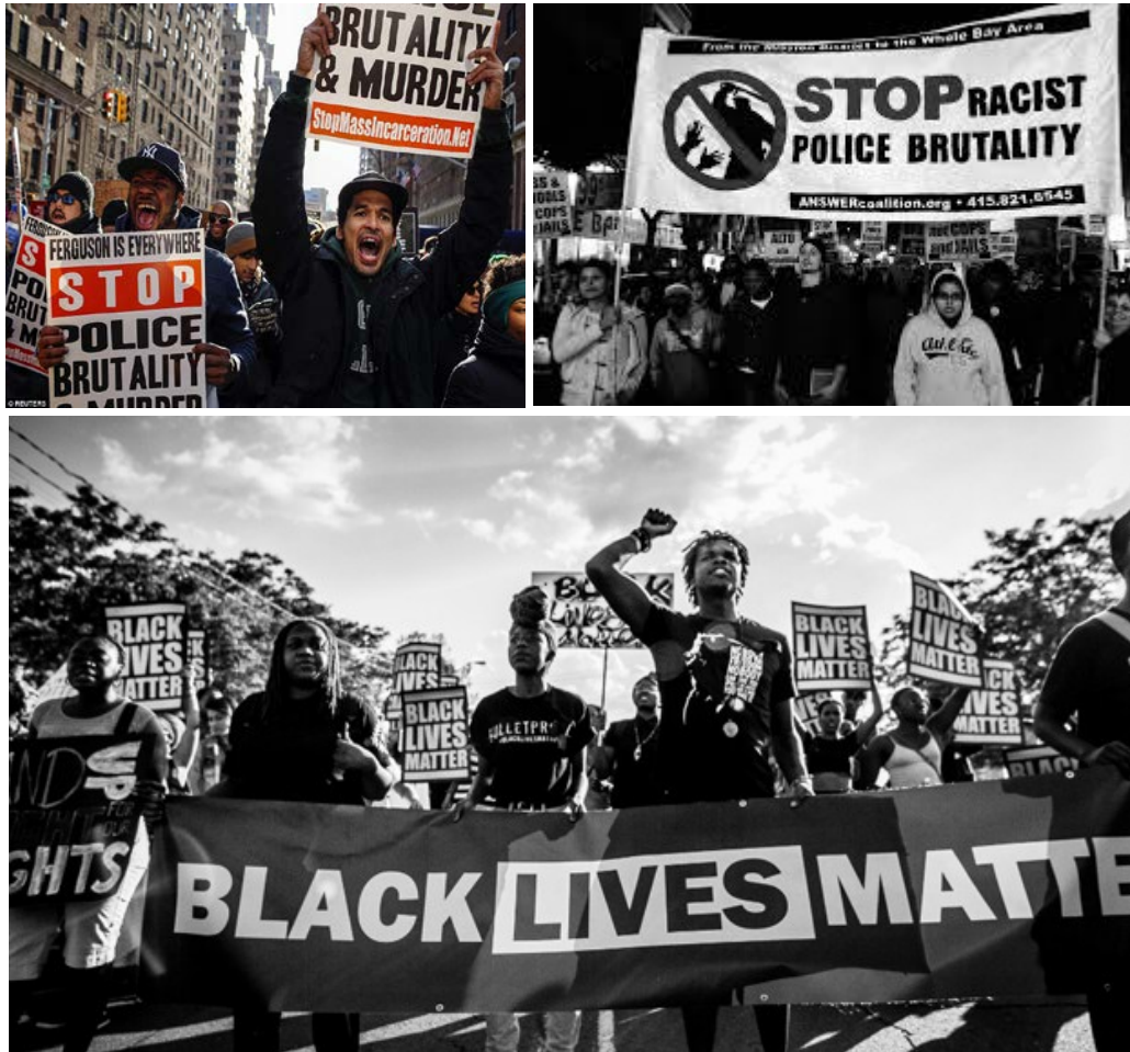
Figure 1. Protest Signs 97

included signs that said, “Stop Police Brutality & Murder,” “Black Lives Matter,” “Jail Killer Cops,” and “Stop Racist Police Brutality” (see Figure 1).