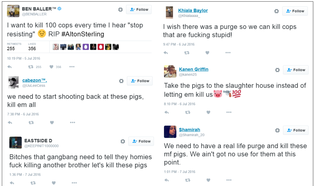
Figure 3. Twitter Posts from Ben Baller and Others Days before Killings of Dallas Police 117

One of the most provocative statements did not actually call for violence but encouraged it: “Soon the tables will turn” was tweeted hours before the ambush killings of Dallas police officers and retweeted 108 times at the time of screenshot shown in Figure 4.