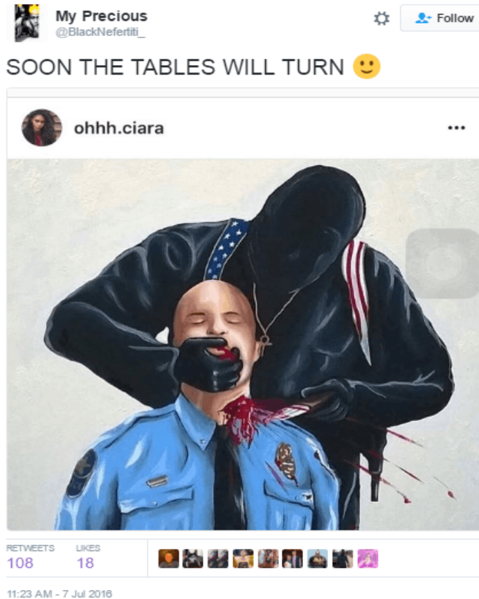
Figure 4. Twitter Post from @BlackNefertiti Hours before Killings of Dallas Police 118

The sentiment to kill cops is an example of how incendiary the relationship is between police and some members of the public.