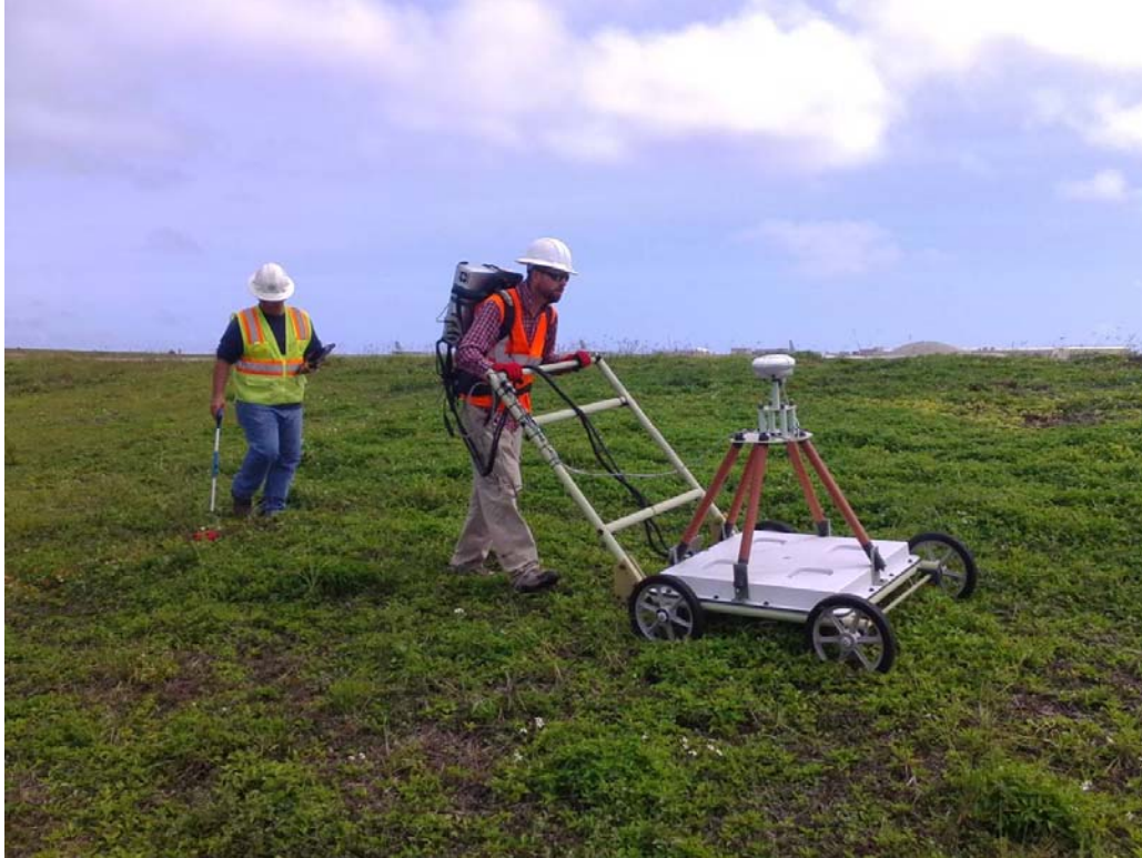
Figure 4.2. TEMTADS 2x2 at Andersen AFB