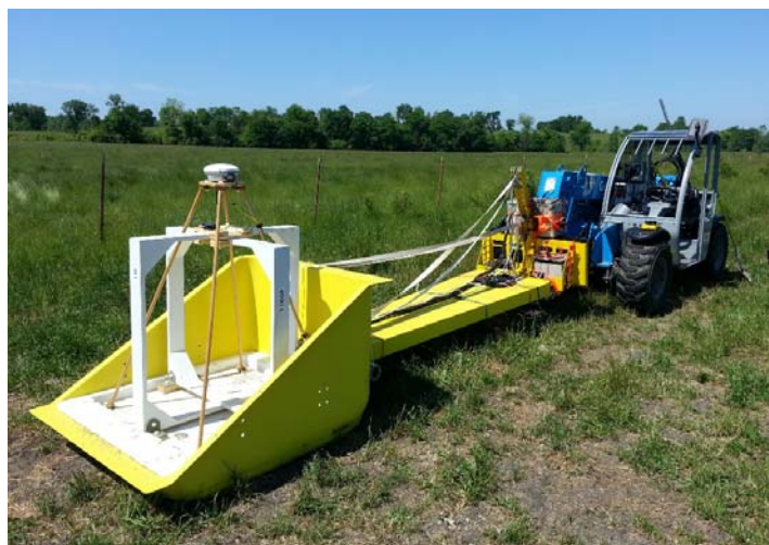
Figure 4.1. MetalMapper at SWPG

The dynamic detection surveys were performed with the MetalMapper sensor seated within a sled, which was attached to the front mount-plate of a diesel-powered tele-lifter (see Figure 4.1). The tele-lifter allowed the MetalMapper to be raised up and down and easily maneuvered side to side. A monitor mounted within the vehicle displayed real-time navigation and sensor information, and allowed the operator to collect data in both dynamic and cued survey modes. EM3DAcquire was used during this demonstration to control data acquisition parameters, storage of data, and navigation.