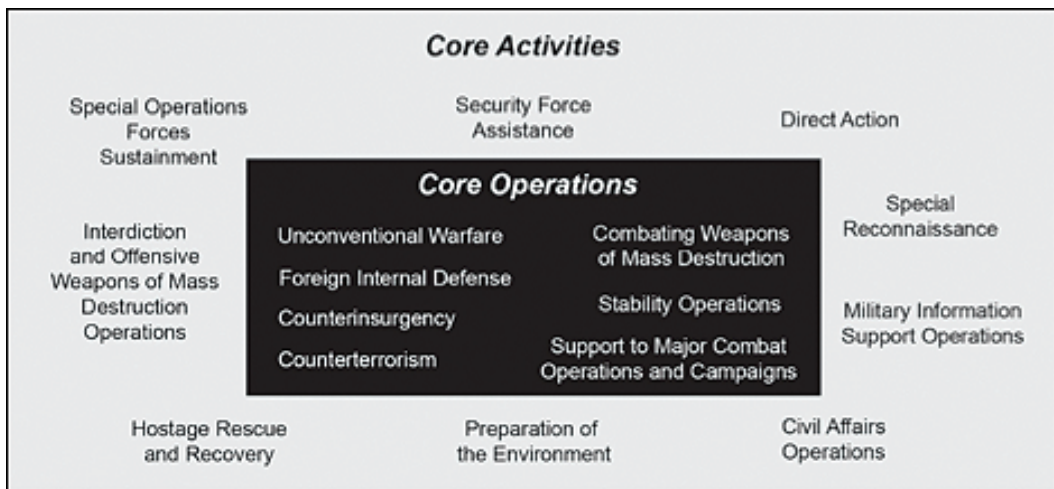
Special operations core operations and activities 6

In simple terms, surgical strike is fundamentally the hyper-conventional raid, and special warfare is indigenous-centric warfighting. Each has its own distinct operational application. SOF operational art is the proper blending of the special warfare and surgical strike