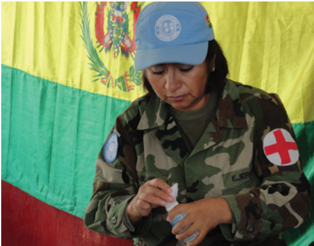
Bolivian peacekeeper providing medical and dental support for internally displaced persons in Cité Soleil, Haiti.

As outlined above, the limited participation of Brazilian military women in peace operations is a direct result of their limited presence in the country's Armed Forces. At the same time, Brazil has been increasing its efforts to enhance women's participation in different levels of decisionmaking processes in peacekeeping operations, and this is likely to have a positive impact in the country's gender balance in the field. The participation approach can be