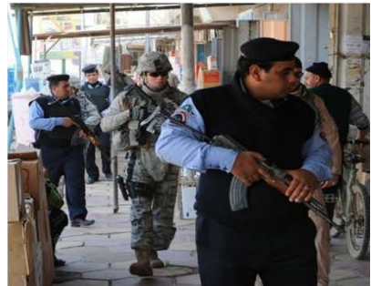
Airmen over-watch with IPs

Defender and IP get on the same page; emphasizing effective "Community Policing" operations.