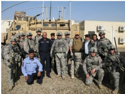
Praetorian's 2-6 and 2-3 at Tarmiyah PPS prior to patrol

Conducting dismounted foot patrol validation with IPs from Tarmiyah IP station into local market