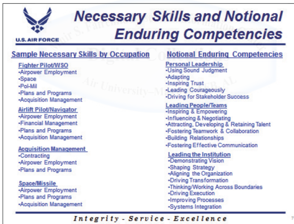
Figure 1. Corona briefing slide, 2002. 10

Officer development evolved over time to meet the changing needs of the AF. In 1999, the voluntary assignment process was replaced with a select-and-assign system where officers were developed with a stove-piped approach within each career field. 7 Then in 2002, the AF implemented a new development process that was intended to not only develop officers with occupational skill sets, but also to develop enduring competencies. 8 These competencies were meant to be a common thread spanning all career fields. Figure 1 is a slide briefed at Corona in 2002 to differentiate occupational skills from enduring competencies. 9