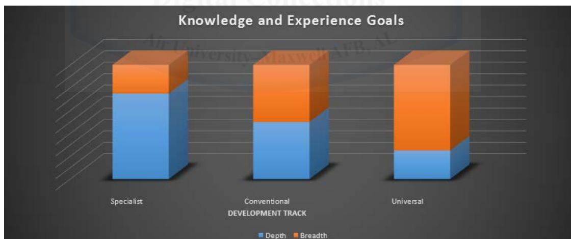
Figure 2. Notional comparison of knowledge and experience goals for each track.

The purpose of the proposed construct is to balance depth and breadth of experience across the AF officer corps, while providing enough predictability in the system to plan for both corporate and career field needs of the future. It also provides additional incentives to retain the best officers. The concept is to establish three separate development tracks within each career field: Specialist, Conventional, and Universal. The purpose of the specialist track is to establish career field stability and groom officers to advance their career field in innovative ways. The goal of the conventional track is to develop a wide range of officers balanced with career field depth and breadth. The universal track's objective is to deliberately develop a limited set of officers in a wide range of skill sets in order to drive better integration across career fields, interagency, and joint in multiple domains. Figure 2 is a notional comparison of the relative ratio of depth and breadth developmental goals for officers across the three tracks.