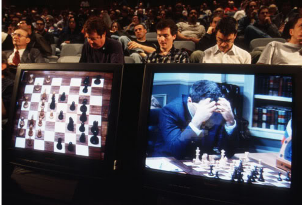
Figure 1. Kasparov playing DeepBlue