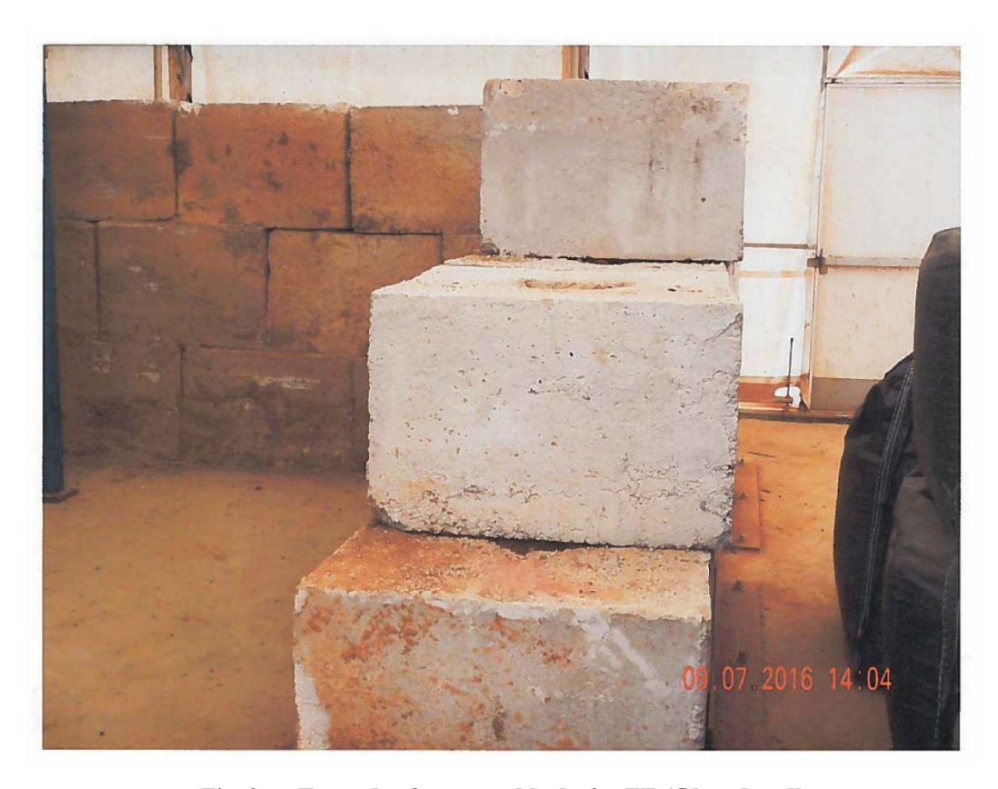
Fig. 3 Example of concrete blocks for EF 15 break wall

After additional consideration and options of control methods, a Living Shoreline was the method approved for stabilization of the shoreline. Jade Creek Construction, LLC, was contacted by the ERG for a site visit, site plans, and ultimately a cost estimate. Afterward, a site plan must be approved through the Maryland Department of the Environment and the US Army Corps of Engineers. Figures 4–6 show Jade Creek's post-site-visit opinions and comments regarding the shoreline damage, methods, and remediation efforts (3 pages).<sup>3</sup>