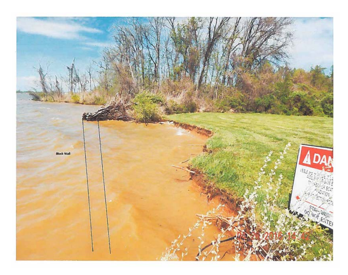
Fig.\ 2\qquad Erosion\ of\ shoreline\ at\ EF\ 15, Spesutie\ Island, and\ (photo-enhanced)\ location\ of\ proposed\ block-wall\ placement