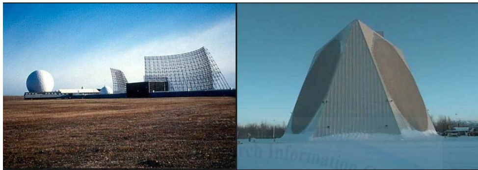
Figure 2: From Left to Right, BMEWS and PAVE-PAWS Radars 52

BMEWS system received a major upgrade for storage of space object orbital element sets, used to track earth-orbiting objects; after this upgrade, the radar was tracking over 8,000 manmade objects. 49 1992 brought another squadron designation change when Clear AFS transitioned to become the 13 th Space Warning Squadron. 50 As the BMEWS mechanical radar reached the end of its life in the late 1990s, a replacement came in the way of a Solid State Phased-Array Radar System (PAVE-PAWS) which came from El Dorado Air Station in Texas. 51