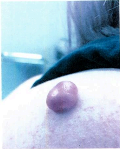
Fig. 1 Pink, 1.5cm x 1cm, fluid-filled bulla on the left lateral upper arm with background keratosis pilaris.