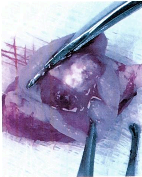
Fig. 2 Gross exam reveals a flaccid bulla filled with serous fluid and a white, firm, calcified core.