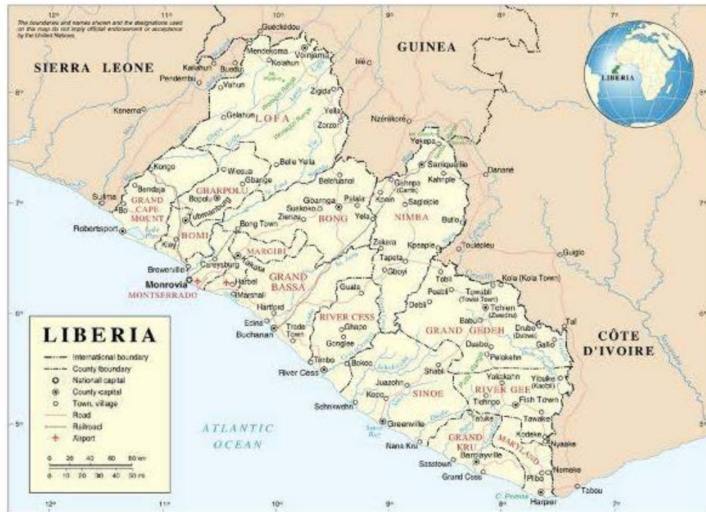
Figure 1. United Nations Map of Liberia