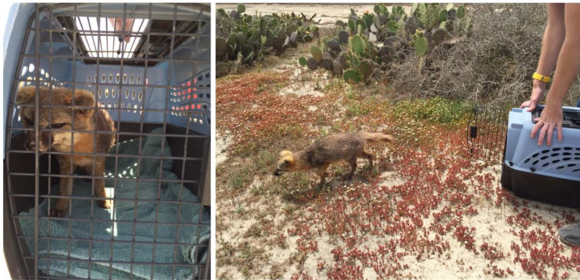
Figure 3. Releasing an elderly island fox patient on San Clemente Island after treatment in the veterinary care facility.

stages of kidney failure. The patient did not have elevated calcium levels, suggesting the kidney failure was likely due to old age versus exposure to toxins. Based on this diagnoses and its declining health, Dr.Vickers recommended euthanasia (Appendix A).