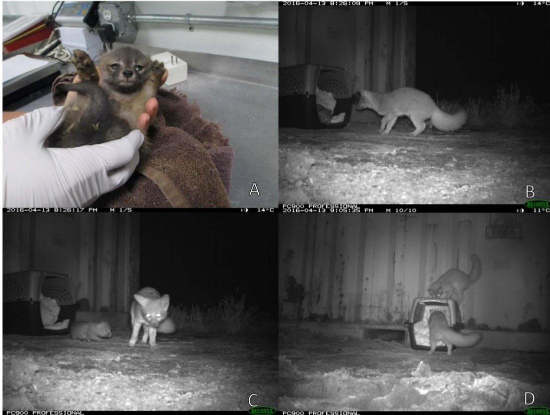
Figure 5. San Clemente Island fox pup retrieved once its den was disturbed (A). The parents return to the pup placed in an open pet carrier (B), and escort it away (C). The parents return without the pup to further investigate the pet carrier (D).

The last patient retrieved near human habitation had been trapped in a dumpster for an undetermined amount of time (Figure 6) and was slightly dehydrated and lethargic (Appendix A). The fox was lactating and presumably had pups, so it was given subcutaneous fluids and high calorie nutrient paste and was released within 5 hours of capture.