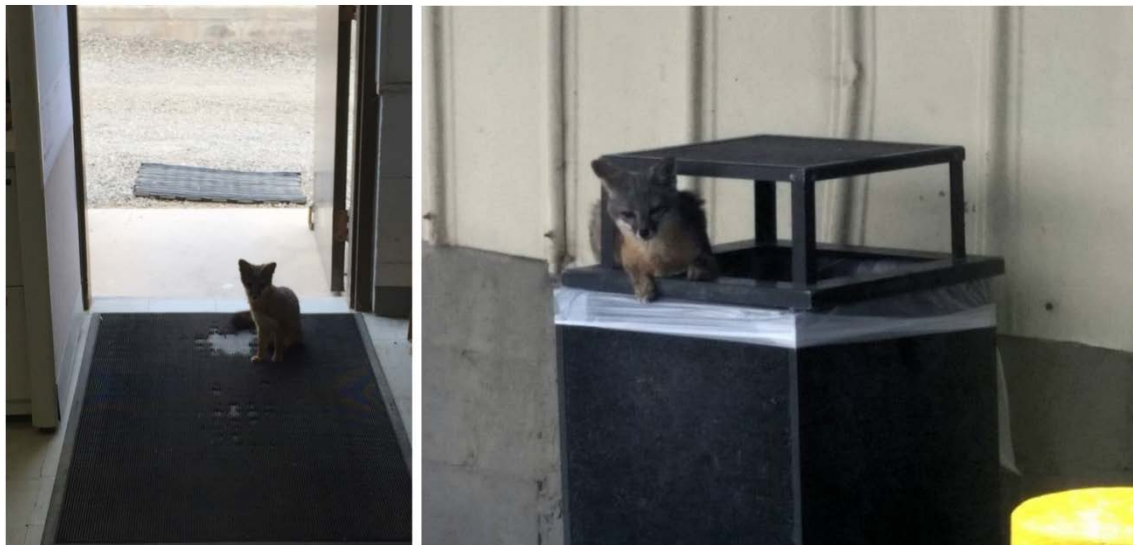
Figure 9. San Clemente Island fox standing in the doorway of a building (A). San Clemente Island fox witnessed jumping in and out of a garbage can to eat scraps (B).

the human habituation that we have observed in many of our patients (Figure 9). These factors could increase the likelihood of spreading zoonotic diseases, such as rabies or canine distemper, within the fox population. Residents on SCI can greatly reduce these abnormal fox behaviors by not feeding the foxes. They can also reduce the risk of accidentally entrapping foxes by changing inspecting outside garbage cans frequently and ensuring the lids to their dumpsters are sealed.