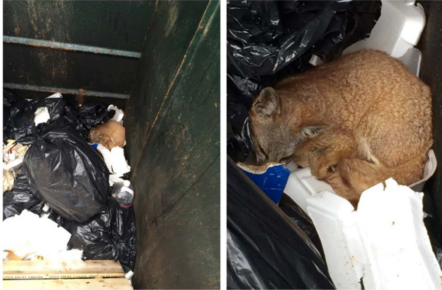
Figure 6. San Clemente Island fox found trapped in a dumpster.

The sixth patient was a fox pup hand captured near ridge road when it was displaying similar ear and balance symptoms to the fox captured near MAROPS (Figure 4, Appendix A). The fox pup had heavy ear mite infestations in both ears, and had multiple apparently self-inflicted scratch wounds around its right ear. We flushed its ears to remove pus and blood and medicated the ears to help reduce swelling and control infection. Its ears were cleaned and treated twice daily until they healed, at which point releasing the pup was approved by Dr. Vickers.