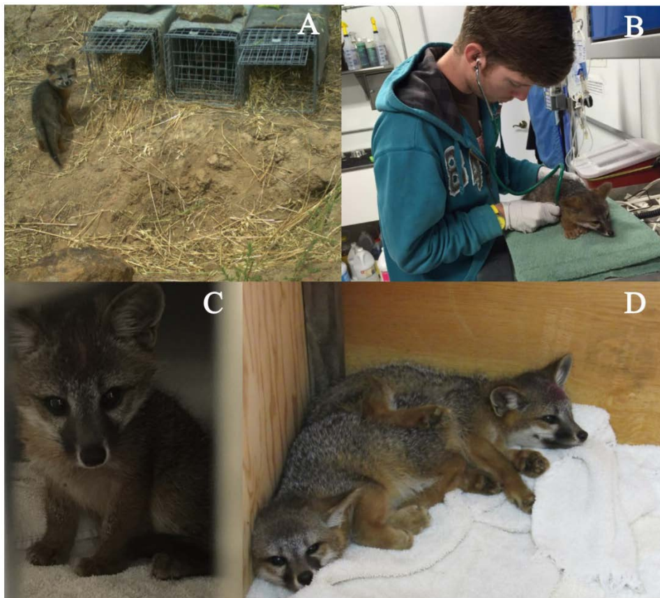
Figure 8. Motion sensor camera photo attempting to trap 1 of 2 orphaned San Clemente Island fox pups (A). Once captured both pups were deemed healthy in our fox veterinary hospital (B and C). The two pups were raised at the Natural Resources Compound for 1 month before being transferred to the Santa Barbara Zoo (D).

second pup was captured 12 hours later and both pups were brought into the veterinary care facility (Figure 8). We continued to maintain the motion sensitive cameras at the den, but no adults visited the site. The pups were deemed healthy, and based on their weights we estimated their age to be approximately 50 days old. After consulting and coordinating with the Navy Installation Biologist, the 2 pups were transported to the Santa Barbara Zoo on month after capture.