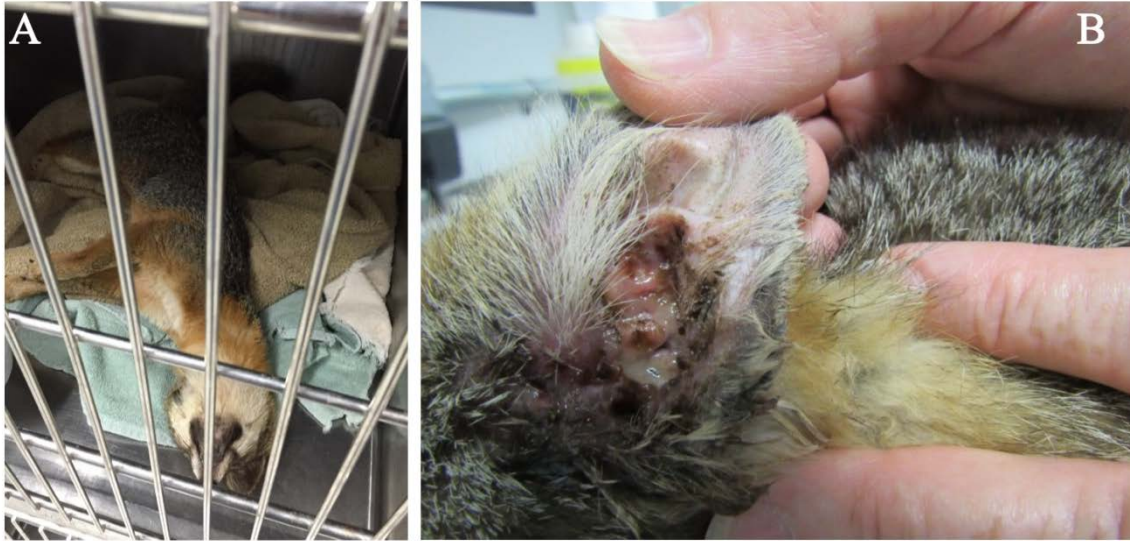
Figure 4. San Clemente Island fox patient unable to stand due to ear infection (A). Side view of ear infection, causing inflammation and puss discharge (B).

We brought in a young fox pup after it was temporarily abandoned by its parents. The pup's parents were scared off when a metal storage container, under which they were denning, was removed. The pup was determined to be in good health (Figure 5), and we placed him in an open pet carrier back at his former den site in hopes that he would be retrieved by his parents. Camera monitoring captured his parents returning to the former den site and retrieving the pup (Figure 5). The parents returned later without the pup to further investigate the pet carrier (Figure 5).