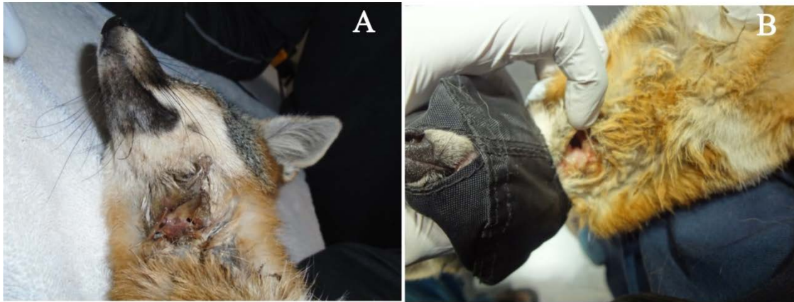
Figure 7. San Clemente Island fox brought in with an unusual infected neck wound (A), which was later determined to be a ruptured abscess (B).

closed properly around the drain, it was removed and flushed until it closed completely and the patient was released.