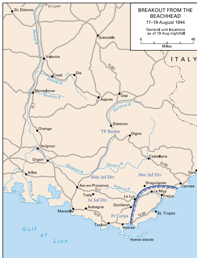
Figure 3. Breakout from the Beachhead. Center of Military History (CMH 72-31), Southern France (Washington, DC: Government Printing Office, 2012), 18.

During this time, General Lucian Truscott ordered the assembly of TF Butler. In July during the planning for the operation, Truscott decided to organize a small mobile strike force after the landings. It provided the army flexibility during the assault. It assembled on the night of August 17 and moved north heading toward Grenoble. By the 19th it was fifty miles north of the 45th Division conducting a reconnaissance-in-force. Its end state would be to move north and then cut west to block the narrow Rhone corridor. It was risky, but within three days, TF Butler drove over 100 miles and was in position at Gap and Aspres to cut off the German forces retreating. Receiving news that the Germans were retreating, Truscott split the campaign into three parts. The first was the conquest of Toulon and Marseille, the second continued to drive west, securing the west flank, and finally TF Butler moved to the north, to be directed behind the