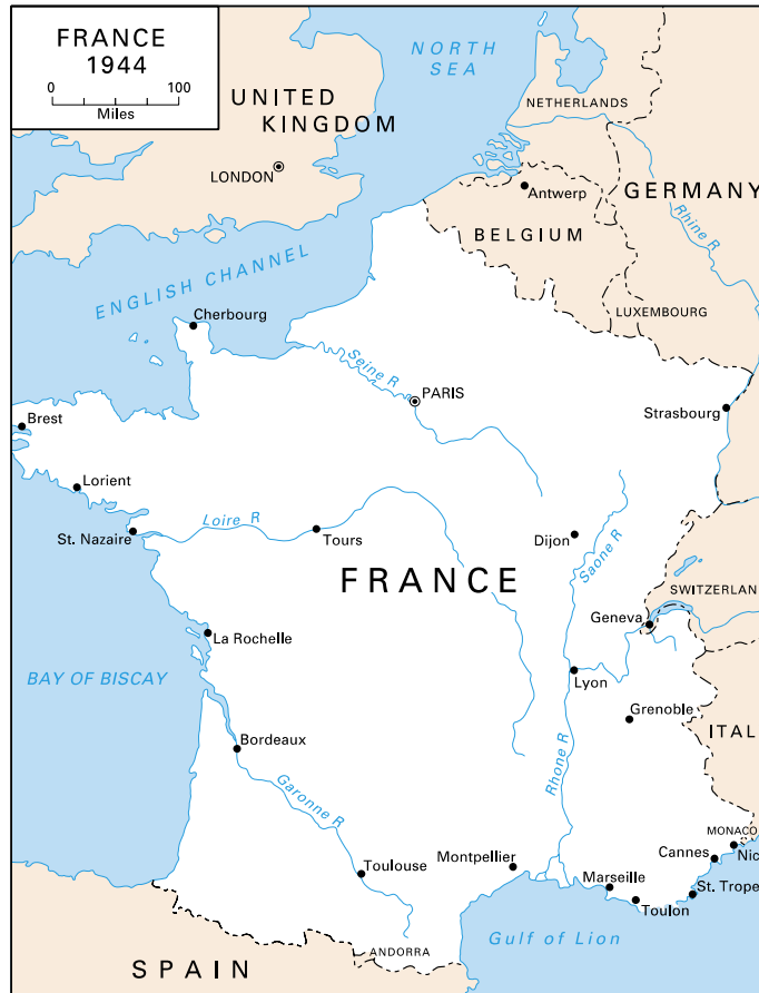
Figure 1. France 1944. Center of Military History (CMH 72-31), Southern France (Washington, DC: Government Printing Office, 2012), 5.