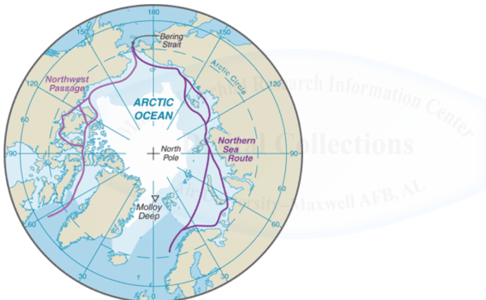
Figure. 4 The Arctic, the Arctic Ocean, Arctic Circle and Key Passages