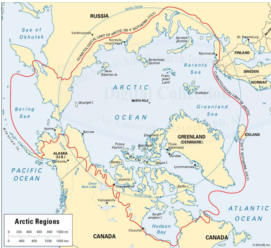
Figure 1. Features of the Arctic; Arctic Circle, North Pole, and 50-degree isotherm. 21