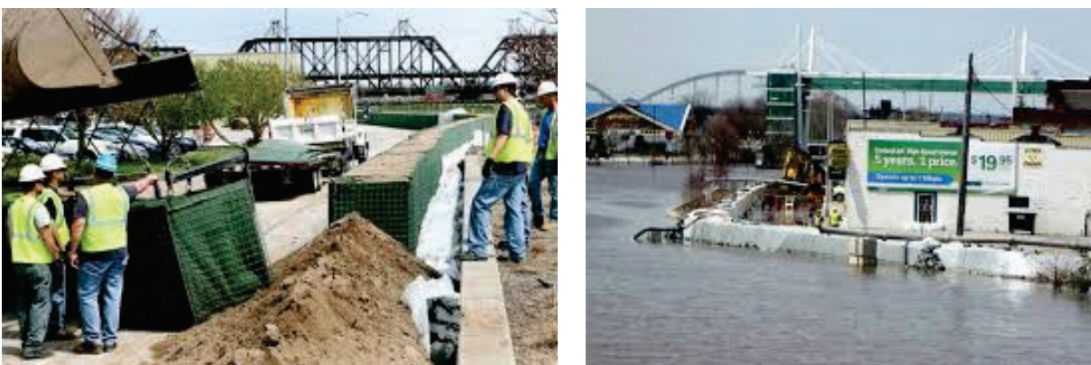
Figure 3. Temporary setback levee constructed of Hesco Barriers along Front Street in Davenport, IA.

Urban areas require greater flood risk reduction and may have existing infrastructure that limits levee setback opportunities in some locations, making remaining FRM options relatively more critical. In a few instances, urban areas are protected by temporary flood barriers designed into parks and transportation networks. Some cities install cost-efficient temporary flood barriers, like Hesco Barriers, in convenient flood-fighting locations (Figure 3).