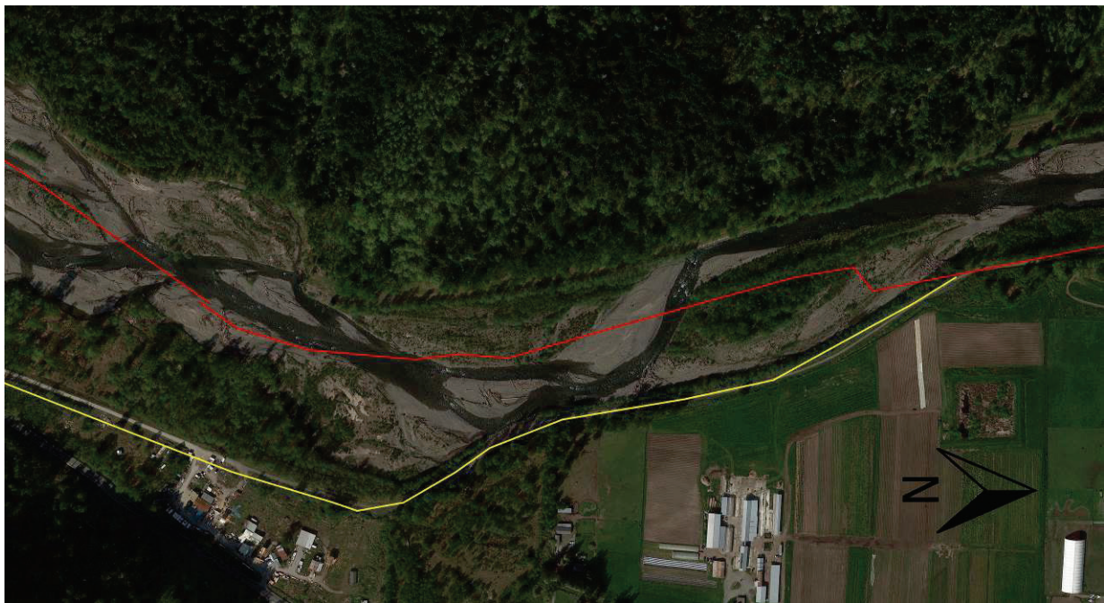
Figure 1. Levee setback on the Puyallup River in Washington State with flow from left to right. The red line indicates the historical right-descending bank levee alignment. The yellow line approximates the present setback levee, which has more than doubled the room for the river in some areas.

INTRODUCTION: Levee setbacks are generally defined in relation to existing, traditional levees. Typical levees constrain the overbank flow of a river to a defined channel to restrict the area of potential flooding. Levee setbacks relocate the levee farther away from the river channel to provide additional floodplain storage, reducing flood heights. This area between the levees and the main river is sometimes referred to as the batture. Figure 1 illustrates how a levee setback can be used to create additional floodplain and allow more room for the river to adjust.