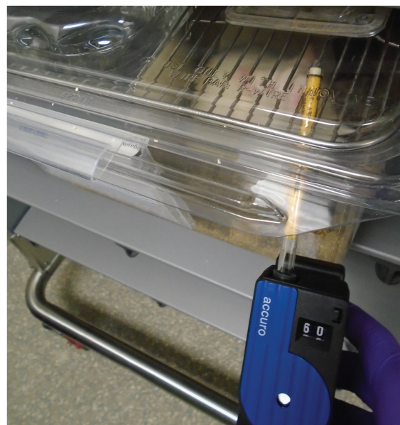
Figure 1. Ammonia measurement through sample port. Pump and ammonia tube are shown, with ammonia tube inserted through the sample port and into the cage, above the wire bar, for ammonia measurement.

Water consumption and cage biomass. All rats were weighed on a digital scale (Olympia Plus, Solenhe, Hamburg, Germany) prior to beginning the experiment. Rats were randomly placed into experimental and control cages, and the total cage biomass did not differ between cages. Water consumption was measured over a 1-wk period; fresh water bottles were placed at the beginning of the study on a Monday, and water consumption was measured by carefully weighing the water bottle from each experimental cage on a digital scale (Solenhe) daily, for Tuesday through Friday (4 data points total). Water weights were recorded to the nearest whole gram for all experimental cages, but no water consumption data were taken for control cages. Water bottles were handled carefully to avoid spillage, and cages were observed daily and monitored for leaks. Water consumption was then averaged for each bedding group. Removing the water bottles did not require the cages to be opened and did not interfere with ammonia measurements.