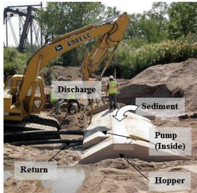
Figure 5. Installation of 30 ft long collector.

The primary component of the collector is a steel hopper (Figures 2 and 5) placed on the bottom along a sediment transport pathway. A manifold system inside the hopper focuses flow across a small region within the hopper, providing high velocities needed to entrain sediment. A dredge pump housed in the hull with the hopper pumps water and sediment through the manifold to the placement area. The pump can also be mounted remotely on land, the preferred configuration for maintenance. Booster pumps can be added to increase the pumping distance, as required.