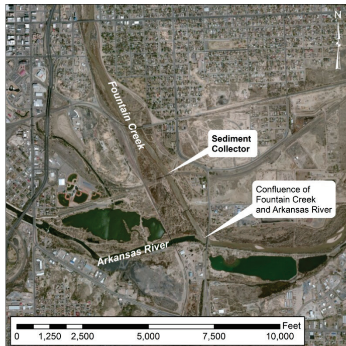
Figure 1. Location of sediment collector.

INTRODUCTION: The first of two technologies being evaluated under this RT is a sediment collector currently installed in Fountain Creek, Pueblo, CO, (location shown in Figure 1) intended to demonstrate technology to alleviate the need for dredging by lowering the downstream grade to reduce flooding and ultimately reduce sediment deposition as far downstream as John Martin Reservoir, a U.S. Army Corps of Engineers (USACE)-managed lake. The system operates on the principle that sediment in bedload can be trapped by gravity and removed at the natural rate of transport, instead of episodically. This DOER TN describes the technology and installation at Fountain Creek, other possible applications, lessons learned, cost, and provides some general guidance for applying collector technology at other sites.