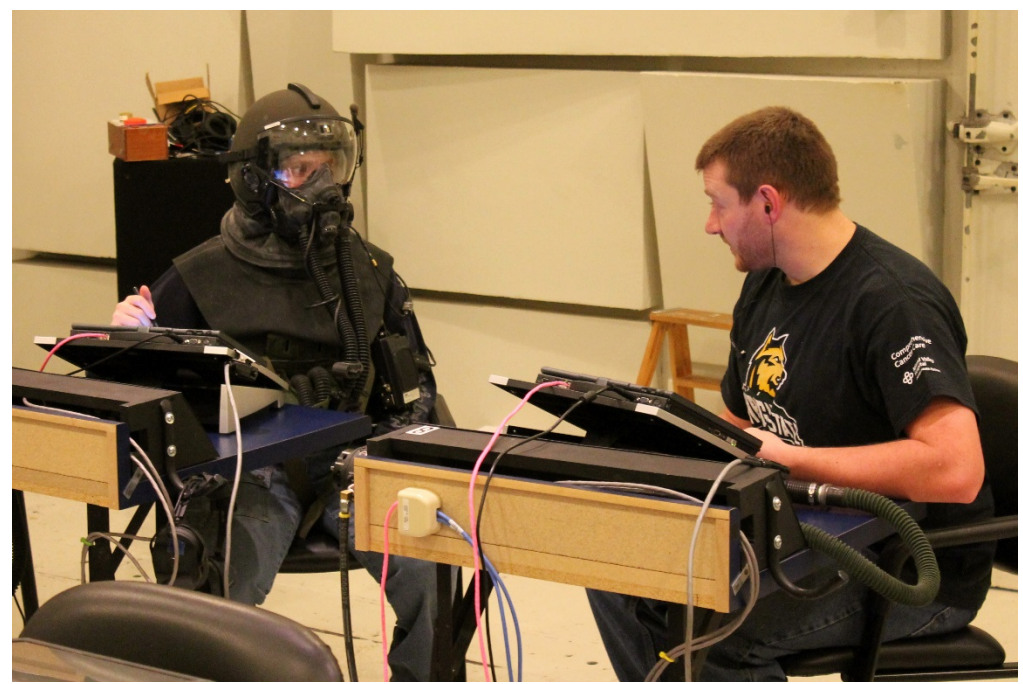
Figure 5. Subjects sitting one meter apart during a low-noise, over-the-air speech intelligibility measurement