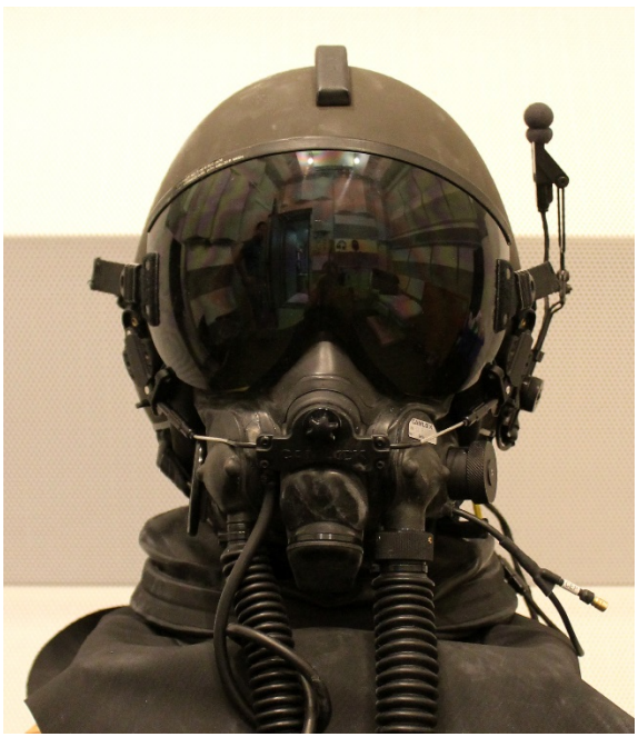
Figure 1. HGU-84/P with JSAM-TA Respirator Assembly (V)5 hood

The designated material solution for the JSAM-TA is the A/P22P-14A respirator (currently in use) with incorporated Engineering Change Proposals (ECPs). The ECPs include: four conductor cable pass-through to integrate with CEP, four separate pockets to hold torso assembly and removal of over-vest, 8 inch lower manifold hoses, and anti-stretch retention cords added to the lower manifold hoses. The official nomenclature will be designated at a later time. From this point on, the A/P22P-14A respirator with incorporated ECPs will be referred to as the JSAM-TA Respirator Assembly (V)5. Due to the engineering changes, additional evaluations are required to ensure airworthiness.