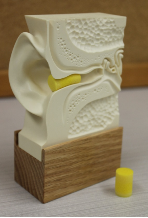
Figure 3. CEP (left) and 3M EAR Classic<sup>TM</sup> foam earplugs (right)

The objective of this study was to measure the speech intelligibility performance of the JSAM-TA Respirator Assembly (V)5 when donned with the HGU-84/P flight helmet and CEP or 3M EAR Classic<sup>TM</sup> earplugs to determine if the CBR respirator met the JSAM-TA JPO performance requirements, as defined in the Purchase Description (PD)<sup>2</sup>, as shown below. To note, noise attenuation measurements were not conducted for the HGU-84/P and are addressed in the Discussion.