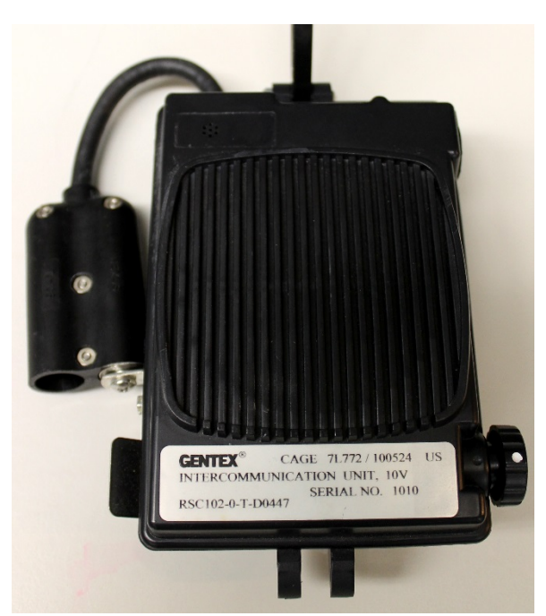
Figure 6. ICU (V)5 (10 volts) used for low-noise speech intelligibility measurements

High-noise environment measurements were conducted to mimic operational environments during flight. Subjects were seated at VOCRES workstations, facing forward, with audio hardwired through a torso mounted CCU (Figure 7). Much like the ICU (V)5, the Gentex CCU is designed to enable clear communication from the pilot to rigger/ground crew when a pilot is wearing a JSAM CBR ensemble (Figure 8). The talker's voice was transmitted from the microphone mounted inside the JSAM-TA Respirator