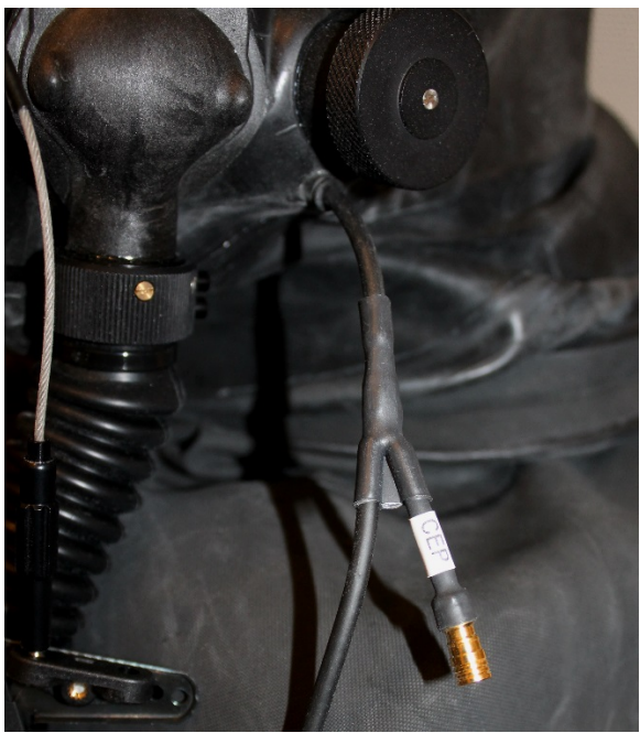
Figure 2. JSAM-TA Respirator Assembly (V)5 hood (left) and close-up of CEP cable pass-through (right)

The JSAM-TA Respirator Assembly (V)5 provides individual aircrew head/eye, respiratory, and percutaneous protection against CBR warfare agents, radiological particles, and continuous protection against CBR agent permeation. The JSAM-TA Respirator Assembly (V)5 also provides protection against selected toxic industrial chemicals and toxic industrial materials. When integrated with aircraft-mounted and aircrew-mounted breathing equipment, the system provides combined hypoxia and CBR protection. The respirator can also be integrated with other aircraft subsystems, including but not limited to, Aircrew Life Support Systems, portable aircrew systems, restraint systems, sighting systems, and communications systems.