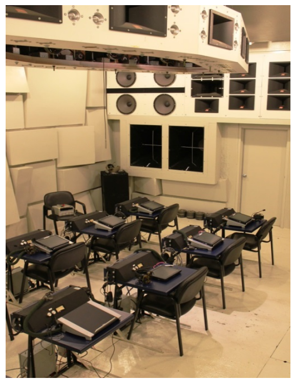
Figure 4. AFRL's VOCRES facility used to measure speech intelligibility performance

The MRT was selected for the test material and stimuli were presented by a live talker. The MRT consists of 50, six-word lists of monosyllabic English words. The goal was to quantify the ability of trained listeners to correctly identify target words transmitted by a trained talker using the combination of the helmet, respirator, and earplugs. Cueing of target words for the talker and recording of listener responses were both accomplished via a custom MATLAB 7.0 application. A laptop computer with a graphical user interface was utilized for subject response. The talker and listeners had individual computers at their respective work stations.