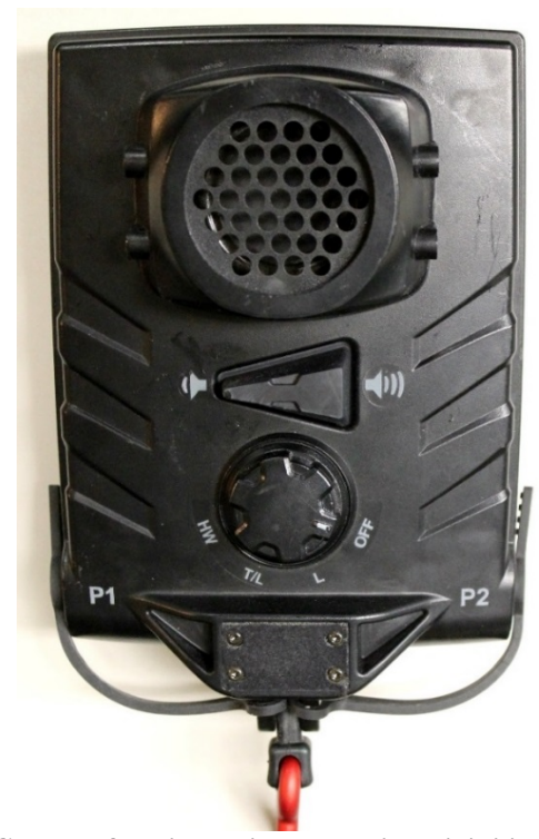
Figure 8. CCU used for high-noise speech intelligibility measurements