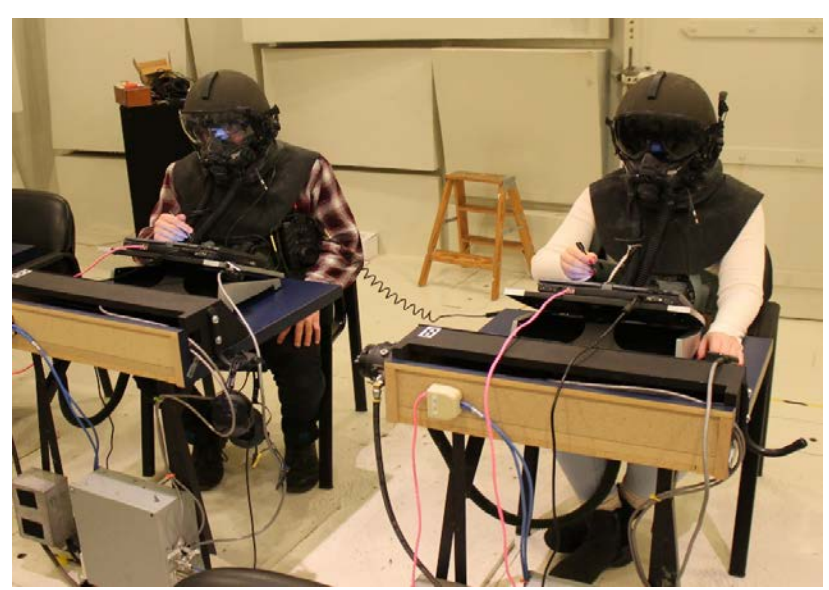
Figure 7. Subjects communicating via CCU for a high-noise, hardwired speech intelligibility measurement

Assembly (V)5, through the CCU (switched to Hardwire Mode), to the listener via CEP or HGU-84/P earcups, depending on the device configuration. Measurements were conducted with the JSAM-TA blower off. Supplemental breathing air was provided by connecting the JSAM-TA oxygen hose to the facility's supplied air system to simulate flight operations. Measurements in the high-noise environment were collected at 95, 105 and 115 dBA.