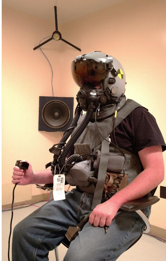
Figure 5. Subject completing the REAT measurement in the HGU-55A/P JHMCS, JSAM-TA Respirator Assembly (V)3, and CEP configuration

ANSI S12.6 requires the measurement of occluded (with helmet/respirator/earplug configuration in place) and unoccluded (without helmet/respirator/earplug configuration in place) hearing thresholds of human subjects. The thresholds for each of the 20 test subjects were measured in two trials for each configuration, paired by unoccluded and occluded ear conditions. The real ear attenuation at threshold (REAT) for each subject, with each configuration, was computed at each octave frequency, 125 to 8000 Hz, by subtracting the unoccluded ear threshold from the occluded ear threshold. The attenuation was then averaged across the two trials for each subject. The mean attenuation performance was calculated across all subjects, at each frequency.