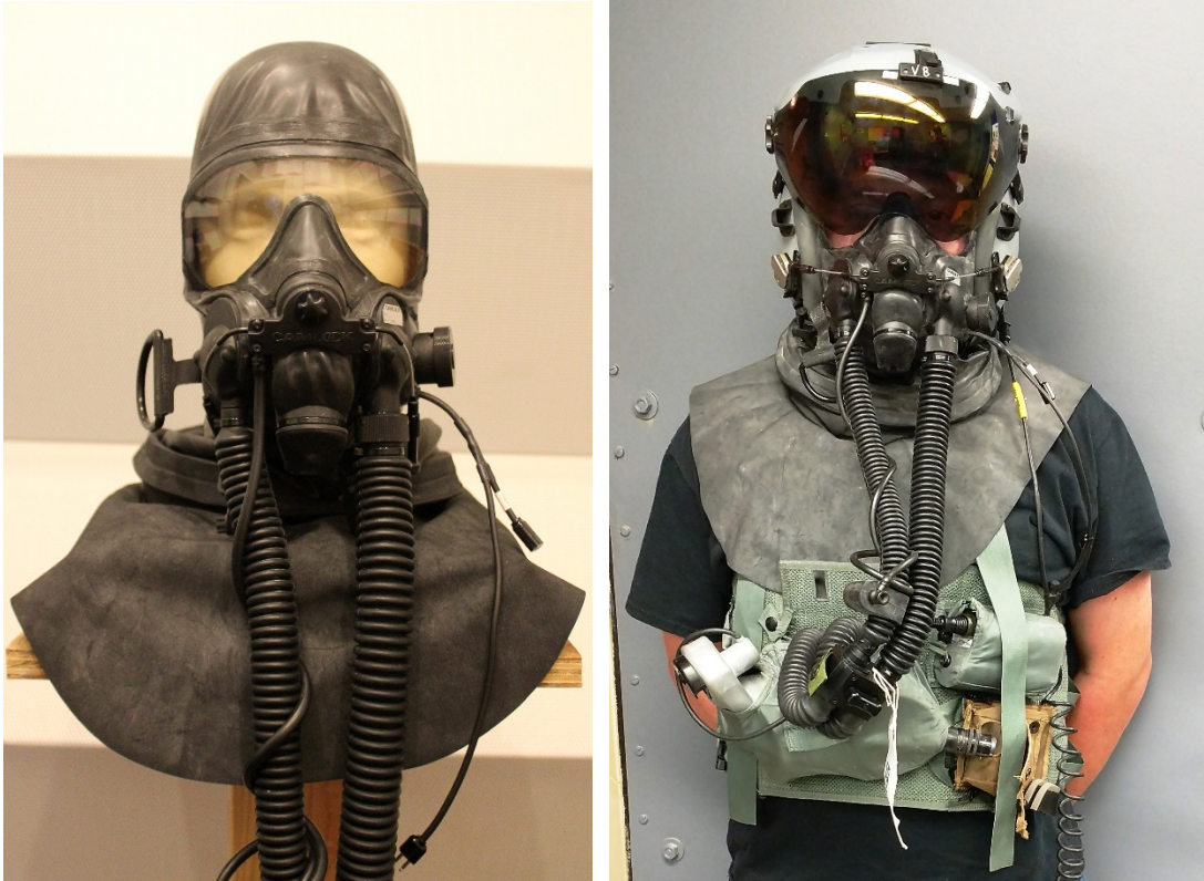
Figure 2. JSAM-TA Respirator Assembly (V)3 hood (left) and JSAM-TA Respirator Assembly (V)3 hood and torso assembly in combination with the HGU-55A/P JHMCS (right)

The JSAM-TA Respirator Assembly (V)3 provides individual aircrew head/eye, respiratory, and percutaneous protection against CBR warfare agents, radiological particles, and continuous protection against CBR agent permeation. The JSAM-TA Respirator Assembly (V)3 also provides protection against selected toxic industrial chemicals and toxic industrial materials. When integrated with aircraft-mounted and aircrew-mounted breathing equipment, the system provides combined hypoxia and CBR protection. The respirator can also be integrated with other aircraft subsystems, including but not limited to, Aircrew Life Support Systems, portable aircrew systems, restraint systems, sighting systems, and communications systems.