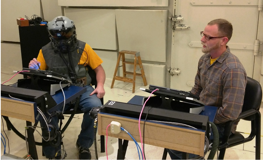
Figure 8. Subjects sitting one meter apart during a low-noise, over-the-air speech intelligibility measurement

High-noise environment measurements were conducted to mimic operational environments during flight. Subjects were seated at VOCRES workstations, facing forward, with audio hardwired through the facility's intercommunication system, Aircraft Intercom (AIC)-25 (Figure 9). The talker's voice was transmitted from the microphone mounted inside the JSAM-TA respirator, though the AIC-25 at the talker's workstation, to the AIC-25 at the listener's workstation, then to the listener via CEP or HGU-55A/P JHMCS earcups, depending on the device configuration. Measurements were conducted with the JSAM-TA blower off. Supplemental breathing air was provided by connecting the JSAM-TA oxygen hose to the facility's supplied air system. Measurements in the high-noise environment were collected at 95 and 115 dBA.