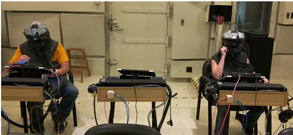
Figure 9. Subjects communicating via AIC-25 for a high-noise, hardwired speech intelligibility measurement

High-noise environment measurements were conducted to mimic operational environments during flight. Subjects were seated at VOCRES workstations, facing forward, with audio hardwired through the facility's intercommunication system, Aircraft Intercom (AIC)-25 (Figure 9). The talker's voice was transmitted from the microphone mounted inside the JSAM-TA respirator, though the AIC-25 at the talker's workstation, to the AIC-25 at the listener's workstation, then to the listener via CEP or HGU-55A/P JHMCS earcups, depending on the device configuration. Measurements were conducted with the JSAM-TA blower off. Supplemental breathing air was provided by connecting the JSAM-TA oxygen hose to the facility's supplied air system. Measurements in the high-noise environment were collected at 95 and 115 dBA.