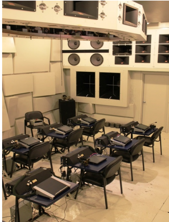
Figure 7. AFRL's VOCRES facility used to measure speech intelligibility performance

The MRT was selected for the test material and stimuli were presented by live talker. The MRT consists of 50, six-word lists of monosyllabic English words. The goal was to quantify the ability of trained listeners to correctly identify target words transmitted by a trained talker using the combination of the helmet, respirator, and earplugs. Cueing of target words for the talker and recording of listener responses were both accomplished via a custom MATLAB 7.0 application. A laptop computer with a graphical user interface was utilized for subject response. The talker and listeners had individual computers at their respective work stations.