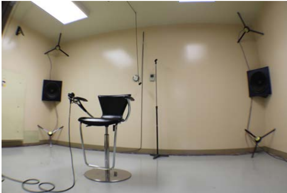
Figure 4. Facility used for measurement of passive continuous noise attenuation

The AFRL facility used for this portion of the study was specifically built for the measurement of the sound attenuation properties of passive hearing protection devices. The chamber, its instrumentation, and measurement procedures were in accordance with ANSI S12.6-1997 American National Standard Methods for Measuring the Real Ear Attenuation of Hearing Protectors 1 . The facility is comprised of twelve loud speakers, three mounted in each of the four corners of the room, with a chair positioned in the center of the room for the subject (Figure 4).