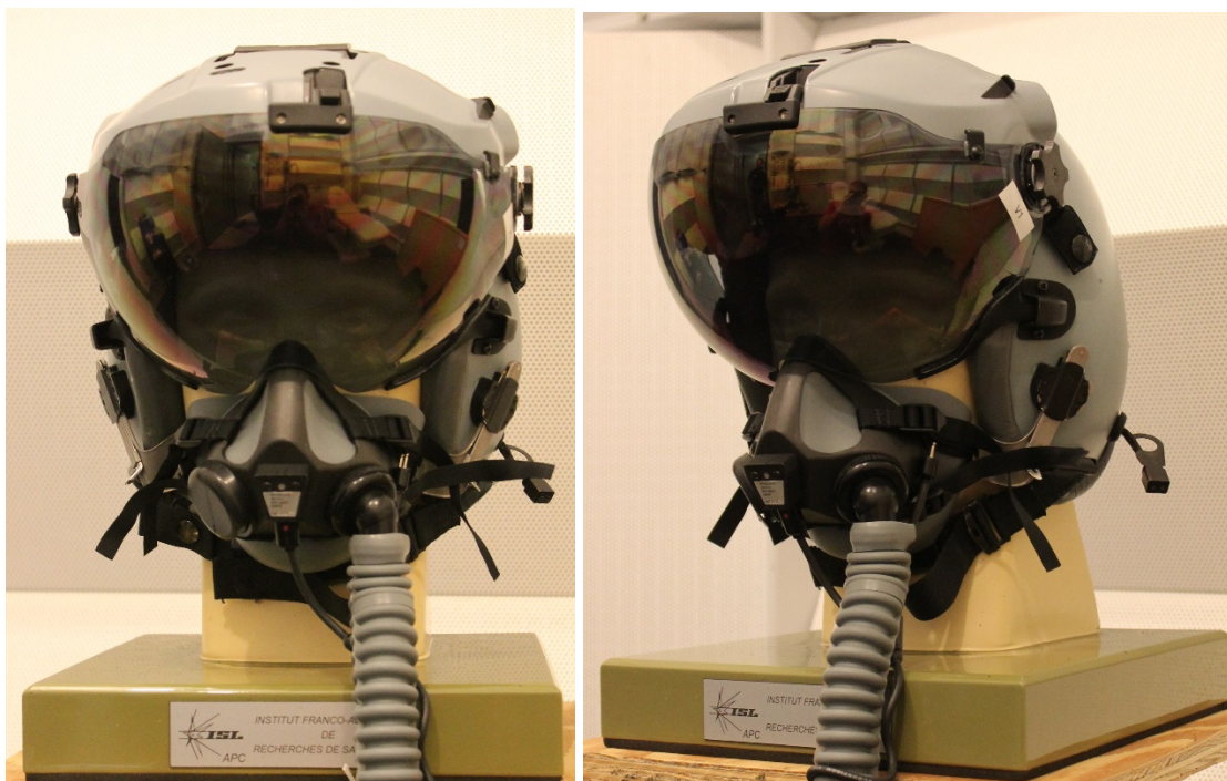
Figure 1. HGU-55A/P JHMCS

The designated material solution for the JSAM-TA is the A/P22P-14A respirator (currently in use) with incorporated Engineering Change Proposals (ECPs). The ECPs include: four conductor cable pass-through to integrate with CEP, four separate pockets to hold torso assembly and removal of over-vest, 8 inch lower manifold hoses, and anti-stretch retention cords added to the lower manifold hoses. The official nomenclature will be designated at a later time. From this point on, the A/P22P-14A respirator with incorporated ECPs will be referred to as the JSAM-TA Respirator Assembly (V)3. Due to the engineering changes, additional evaluations are required to ensure airworthiness.