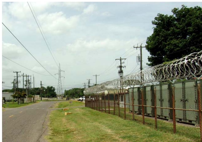
Figure 1: A Host Nation power line runs in close proximity to a US military base, which could provide significant fuel and cost savings.

The Department of Defense (DoD) operates a significant number of bases outside of the United States in cooperation with the local host nation. Each base relies heavily on electrical power to accomplish their mission. In countries with poor electrical system reliability the power for these bases are typically provided by diesel generators with the fuel either purchased from the local population or transported from fuel depots. This incurs a significant cost for the DoD and introduces an additional vulnerability with the transport of fuel.