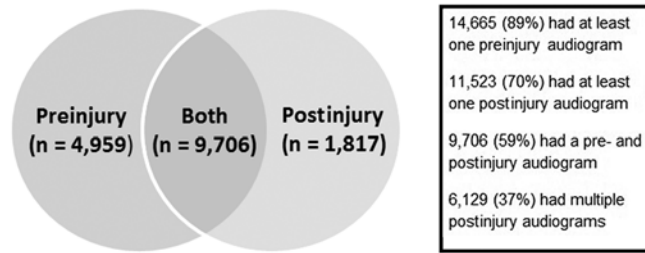
Figure 2. Frequencies and proportions of deployment-injured Navy and Marine Corps personnel in the Blast-Related Auditory Injury Database with pre- and postinjury audiograms ( N = 16,482 ; 43 subjects were missing injury date and could not be included in the Venn diagram).

nonbattle injury groups consisted of minor to moderate injuries as defined by the AIS (90% vs 98%); however, nonbattle injuries were significantly less severe, with less than 2 percent of injuries classified as serious or worse compared with 10 percent for the battle-injury group.