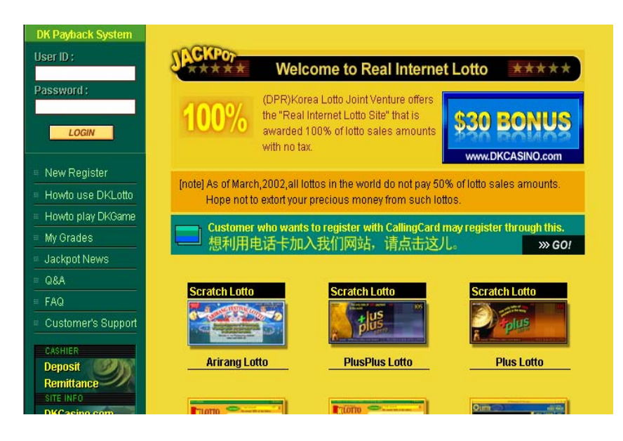
Figure 19.1. DPRK Lotto Website