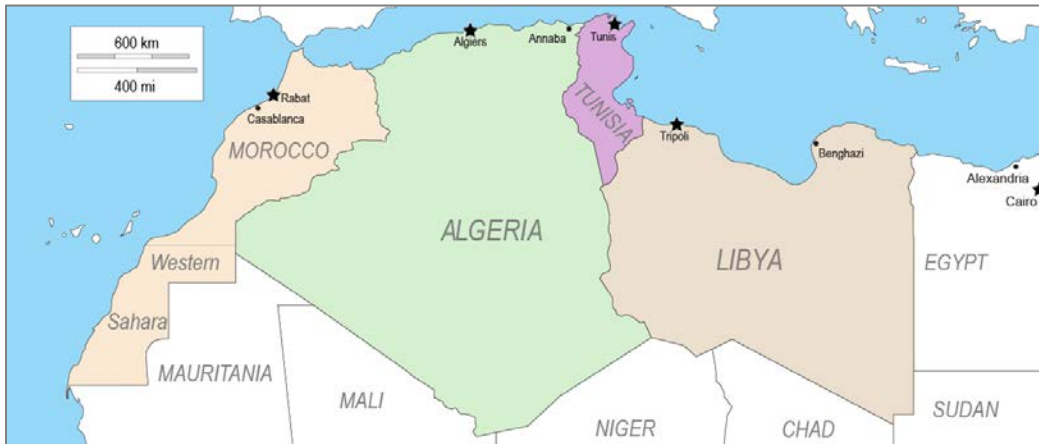
Figure 1. Map of the Maghreb