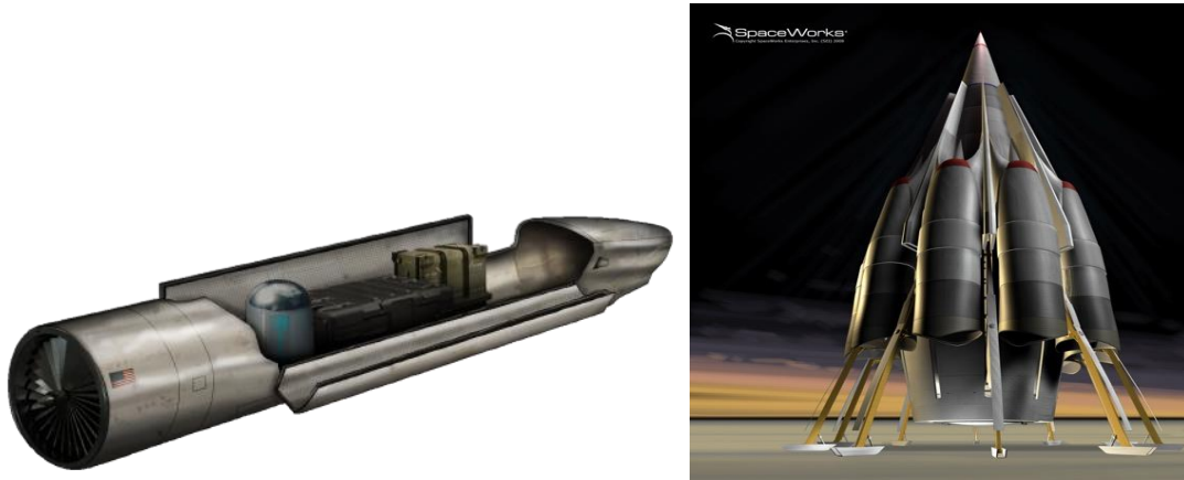
Figure 3 – Artist depiction of Expendable Entry Capsule and its deployment. 25