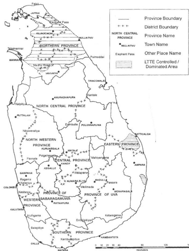
Figure 2. The Areas Controlled by the LTTE during the 2002 CFA. 279

The SLFP-led United People's Freedom Alliance (UPFA) won the 2004 elections with its promise to advance the peace process. Bandarage states that mass discontent with the handling of the peace process was the reason for the defeat of the UNF and the resurgence of Sinhala nationalist parties in 2004. 280 The GoSL rejected the LTTE's claim as the "sole representative of Tamils" and the ISGA proposals. 281 The LTTE walked out of negotiations in 2004 and resumed terrorist attacks statewide. During the 2005 presidential elections, the LTTE prohibited the people from voting to prevent the UNP's Ranil Wickramasinghe assuming office. Mahinda Rajapaksa became the president and