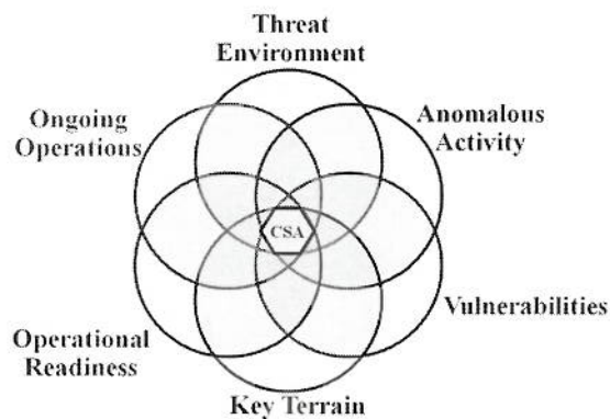
Figure 1. Notional intersection of classes of information requires continuous assessment to provide Cyber SA and enable critical actions and decisions

As shown in Figure 1, the intersection of any combination of these classes provides more information and moves towards the sweet spot of SA. The factors from all six classes must be continuously assessed in order to provide a true, accurate and holistic representation of the domain which supports the ability to take critical actions and make decisions.