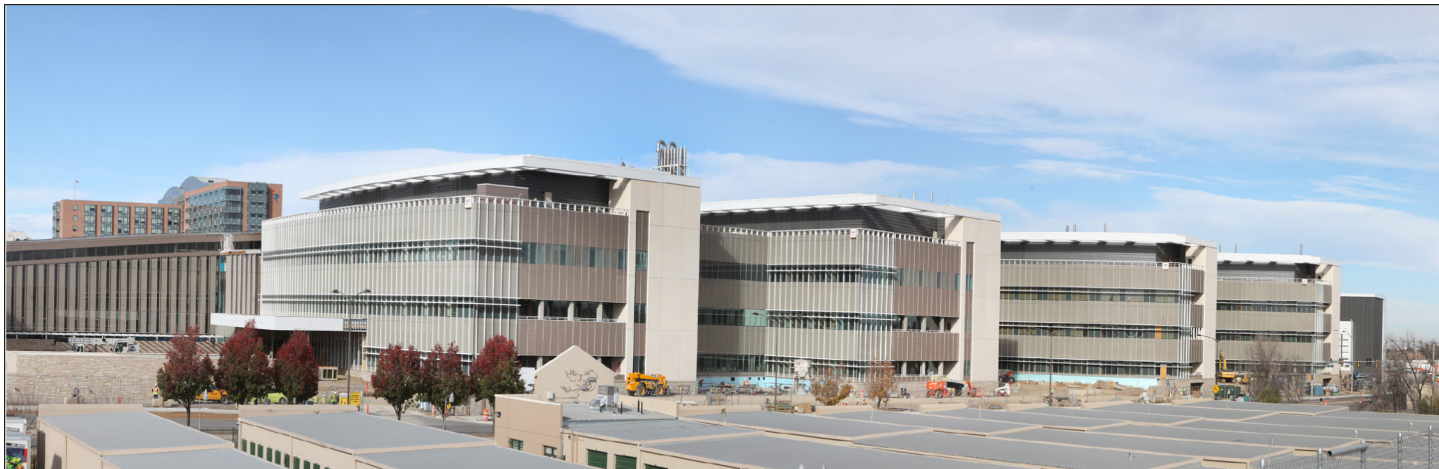
Figure 2: Denver Department of Veterans Affairs Medical Center Project (November 2016)

GAO-17-70