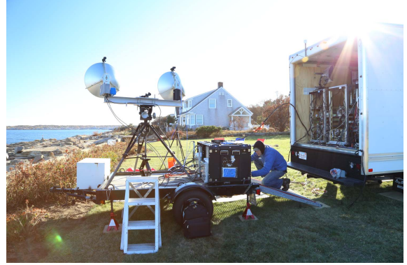
Fig. 1. Four Eyes X-band polarimetric radar is shown. At left, Four Eyes' data acquisition hardware is shown in the leftmost rack, its frequency generation and receiver hardware in the center rack, and its waveform generation and upconversion hardware in the rightmost rack. At right, Four Eyes is shown as installed in the box truck and on location in Massachusetts' Cape Ann. The radar's amplifiers and antennas are visible on the trailer behind the truck.

pulse decimation in post-processing of lower-PRF data. Additionally, all waveforms were transmitted in both alternating and simultaneous polarimetric schemes. The intent behind these choices was to enable characterization of algorithmic performance across a range of relevant radar parameters. These and other key parameters are summarized in Table I.