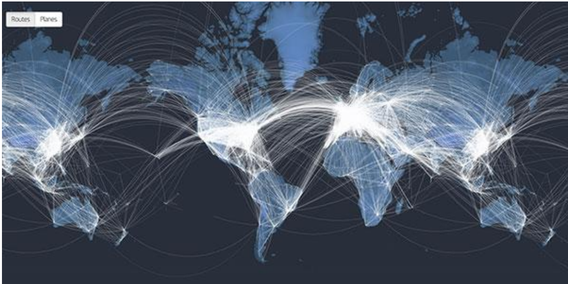
Figure 2. Global Airline Routes