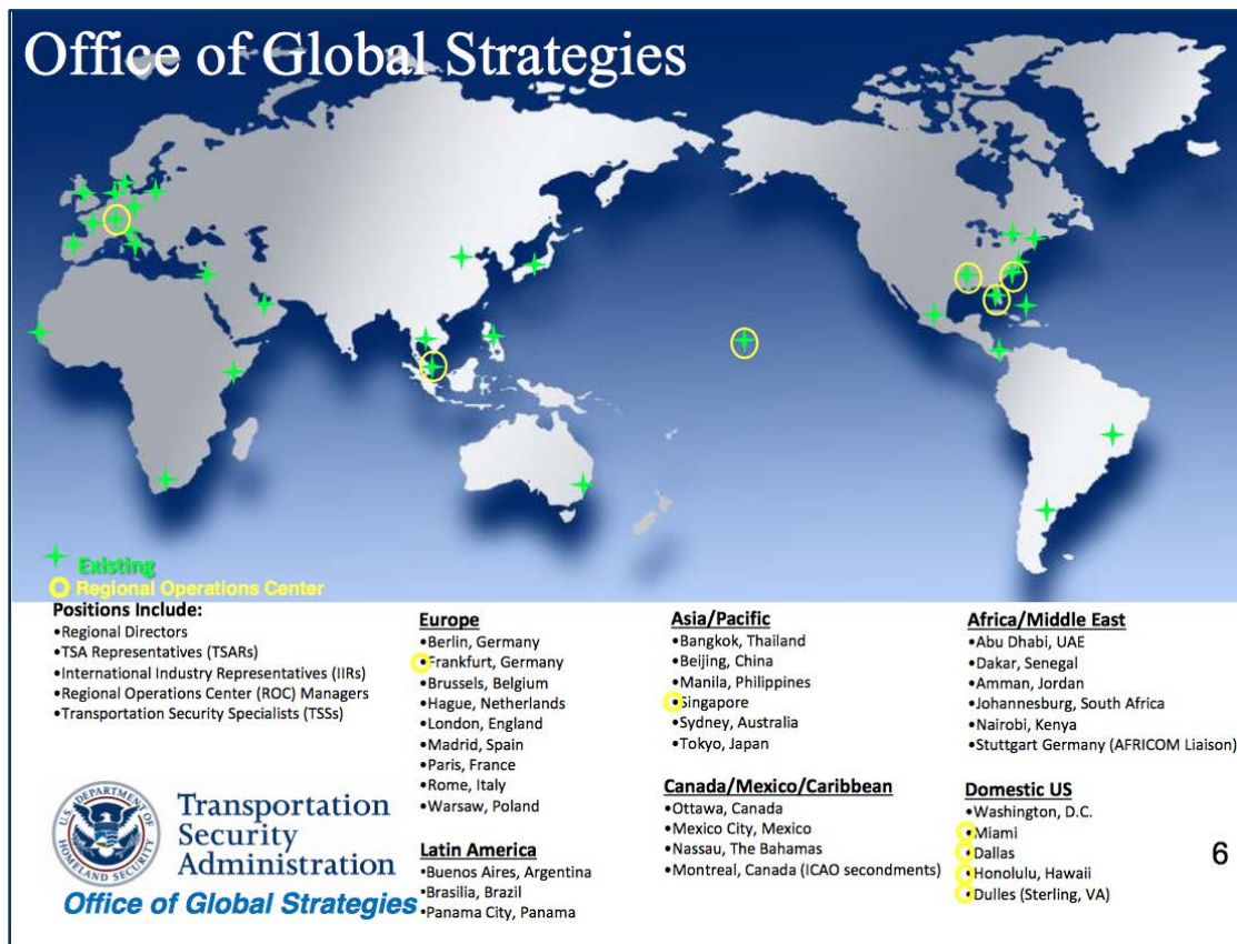
Figure 4. TSA Locations with Security Objectives