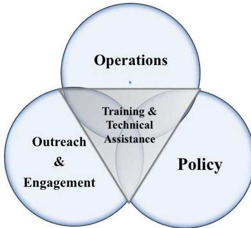
Figure 5. DHS International Programs Model

Using this model, DHS and its component agencies can work to establish a strategy for international engagement and assistance. This model serves as a baseline for understanding international operations and working internally with more information to determine redundancies, costs, priorities, agency capabilities, scopes, and missions. This model also simplifies DHS' complex international footprint and can support DHS' efforts to pursue the additional recommendations outlined.