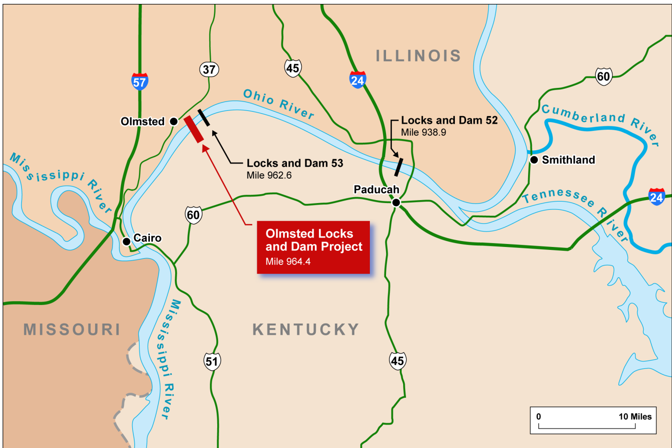
Figure 1: Location of the Olmsted Locks and Dam Project

Sources: U.S. Army Corps of Engineers (information); Map Resources (map). | GAO-17-147