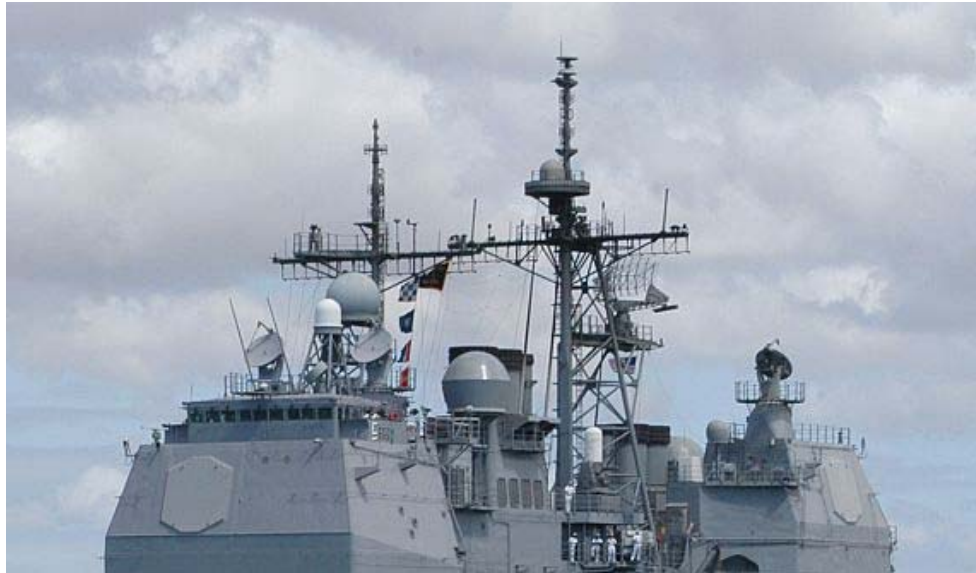
Figure 1. Superstructure of a Ticonderoga Class Cruiser

Source: Keller J (2014) Navy to pour more time and money into shipboard antenna project to cut RF cross interference. (12 June), Military & Aerospace Electronics, http://www.militaryaerospace.com/articles/2014/06/navy-extends-intop.html .