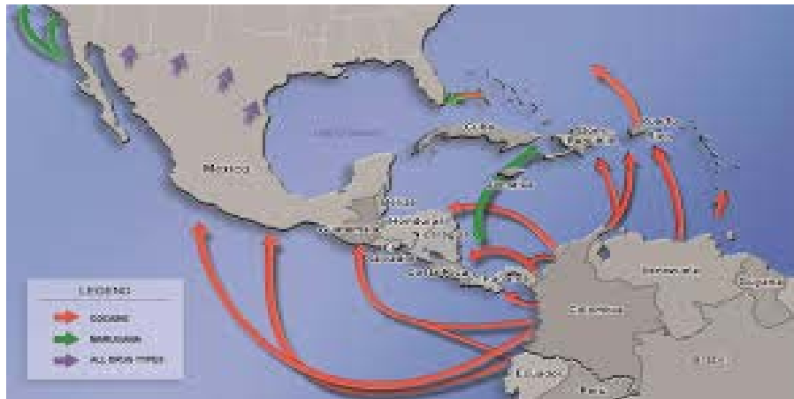
Figure 2. Drug Transit Zones 77

Drug Transit Zones are highly valuable for narcotic traffickers because they use these sea-lanes as transportation of their products—undetected. Nieto Gomez asserts this ideological movement as,