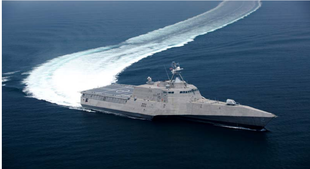
Figure 8. USS Independence (LCS 2) 151

These vessels span 421 feet in length; their beam at the widest breadth is an astounding 103.7 feet, and they have a shallow draft of 14.6 feet. 152 Powering this wide aluminum vessel, the Independence class utilizes a CODAG propulsion system much like its Freedom class counterpart; however, it packs two of its predecessor's (Oliver Hazard Perry frigate) LM2500 gas turbine engines (59,005 HP) in conjunction with two MTU 20V 8000 diesels (25,748 HP), thus propelling it to speeds in excess of 50 knots. 153 Additionally, Table 4 illustrates the Independence class' armament and sensors (without a specified module):