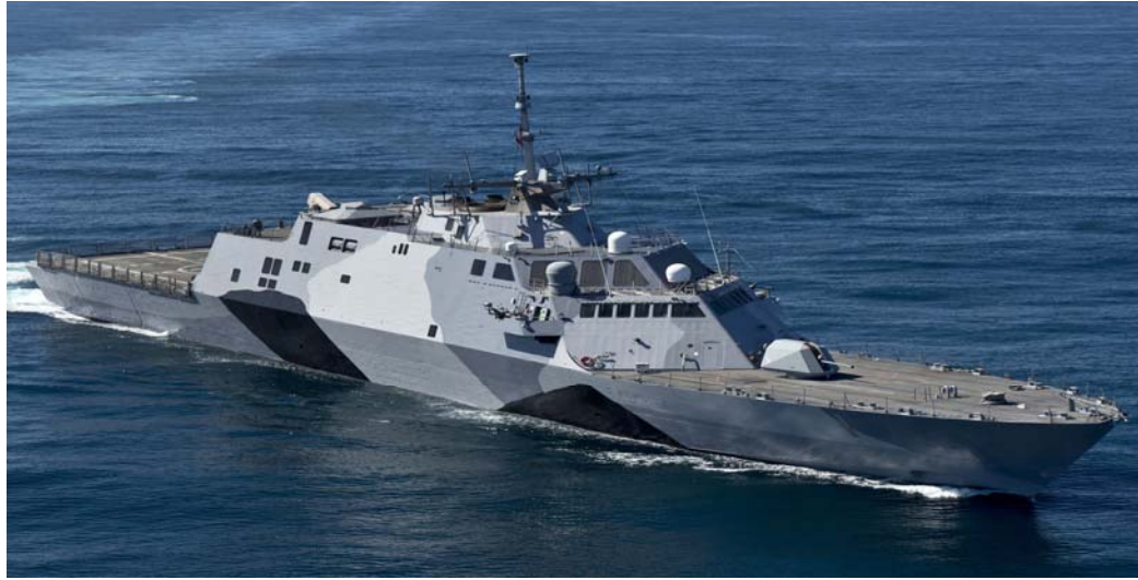
Figure 7. USS Freedom (LCS 1) 145

Additionally, the ship spans 378.3 feet in length, has a beam of 57.4 feet, and a staggering shallow draft of 13.5 feet. 146 To complement its relatively small size, its engineering plant uses a Combined Diesel and Gas (CODAG) propulsion system—powered by twin Rolls Royce MT-30 gas turbine engines (96,500 HP), in addition to twin Fairbanks Morse Colt-Pielstick 16PA6B diesel engines (17,160 HP). 147 Using this hybrid propulsion system, the ship is propelled through the water using four Rolls Royce Kameawa 153SII water jets, enabling the Freedom to operate on either gas turbine or diesel engines at a maximum of 40 plus knots. 148 In addition to its high-powered engineering plant, Table 3 illustrates the Freedom class' armament and sensors (without a specified module):