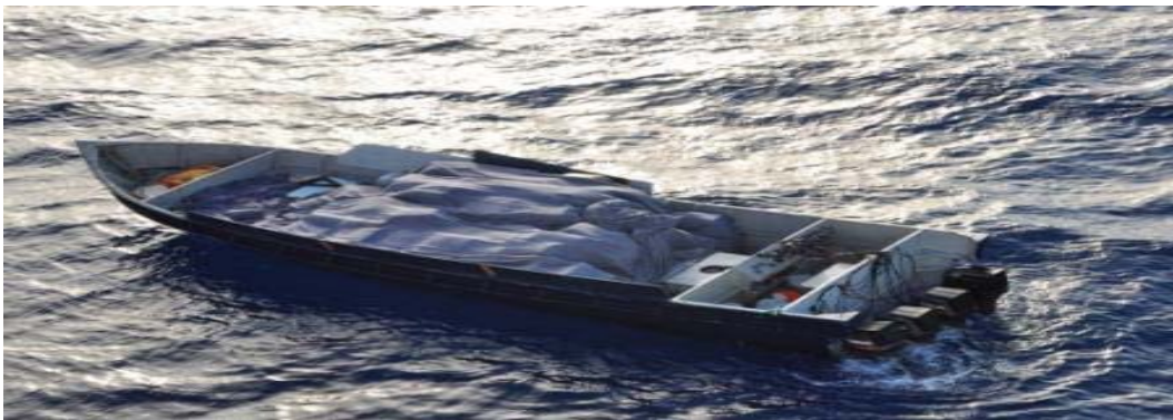
Figure 4. Drug Panga “Go-Fast” 85

cheaper, less costly approach for transportation. These are normally used in Caribbean trafficking, but are also lucrative in the Eastern Pacific transit zones. Pangas are simple wooden fishing vessels that are much smaller than subs, semi-narrow in nature, and are very fast (usually containing multiple outboard engines). According to Department of Homeland Security officials, Pangas “Have no inside floor, no cockpit, and no extraneous markings... they are efficient, cost effective, have superior handling, and are difficult to detect and often travel at night in order to avoid detection.” 84 These particular vessels, like the one shown in Figure 4, carry a much lesser risk of being caught because of their speed and ability to jettison (throw overboard) their product if pursued.