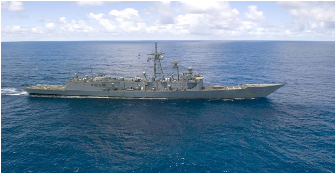
Figure 1. USS Rodney M. Davis (FFG-60) 35