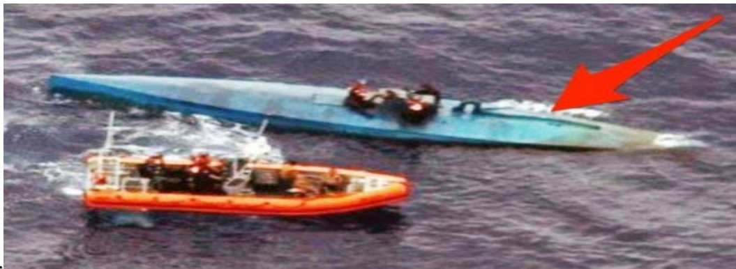
Figure 3. Narcotic Semi-Submersible 83

narcotics smuggled into the United States are transported via maritime lines. 79 Of that 80 percent, 30 percent were transported via narco-subs. 80 These subs “Are custom made, self-propelled vessels built by drug traffickers to smuggle their goods. Over the years, their engineering, design and technology have improved, thus making them more difficult to detect and capture.” 81 These vessels typically come in three different variants and can carry upwards to seven metric tons of cocaine per run: Low profile Vessels (LPV)/Self Propelled Semi-Submersibles, Submersibles/Submersible Vessels (FSV), and Narco-Torpedoes (which are towed vessels). 82 Though these vessels require an immense amount of time, money, and secrecy to build, they yield a great deal more in return when a successful shipment arrives. Figure 3 demonstrates an example of a narco-sub (Semi-submersible).