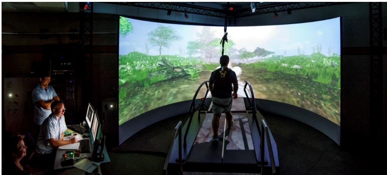
Figure 2 - The GRAIL system in operation.

The grant awarded to Alabama State University was focused on the acquisition and installation of a GRAIL system in the Biomechanics and Motor Control Laboratory. This was accomplished on July 27, 2015 (Figure 2). A timeline for the acquisition and installation was described in