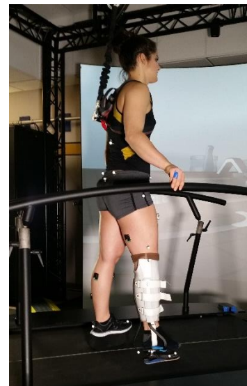
Figure 4 - Another student project used the GRAIL to test prosthesis emulators they developed.