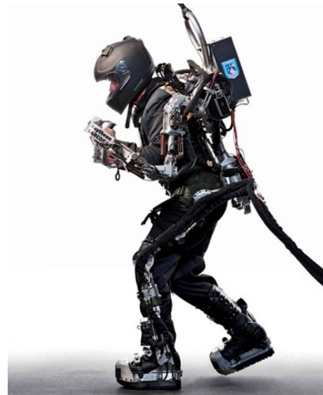
Figure 1 - This powered exo-skeleton must integrate with the human operator to work in parallel with his movement while overcoming the mechanics imposed by the task and the environment. Problems with control can arise when the human operator applies forces on the exo-skeleton that conflict with what was expected by the controller. This error results in falls or sub-optimal movement.

The installed GRAIL system will advance Department of Defense research interests through describing fundamental locomotor control principles. These principles are critical to the development of powered exoskeletal systems that integrate with a human controller/operator. For example, have you ever helped someone up out of a chair and up expected them to pull against you more than they did? For a couple seconds, both of you attempt to adjust your pull until either the person uses your assistance to get out of the chair but with inefficient movement or they drop your hand and get up on their own. A powered exoskeleton working without a direct link into the operator's nervous system has the same problem. It must work in parallel to what the human operator intends and without direct communication between the two. The powered exoskeleton should mimic and work with the human operator and appropriate time and apply joint torques/powers to assist the human with the chosen task (Figure 1). However, motor control of human locomotion is a complicated task and predicting how the human motor system regulates steady state walking has proven difficult with high error rates when a computer attempts to predict lower limb control. For example, active duty Military