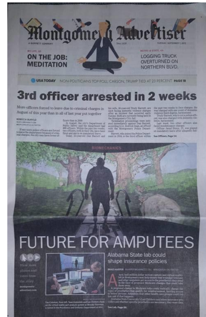
Figure 7 - The GRAIL system was used to expose larger audiences to how this increase in research infrastructure will benefit those that depend on optimization of a human with a machine.

The GRAIL system increases the research infrastructure at Alabama State University and this increase in infrastructure has led to many Media outlets showing our laboratory to a larger audience. The GRAIL system has been featured on local news, the front page of the newspaper (Figure 7), and a magazine dedicated to prosthetics and orthotics. 5-7