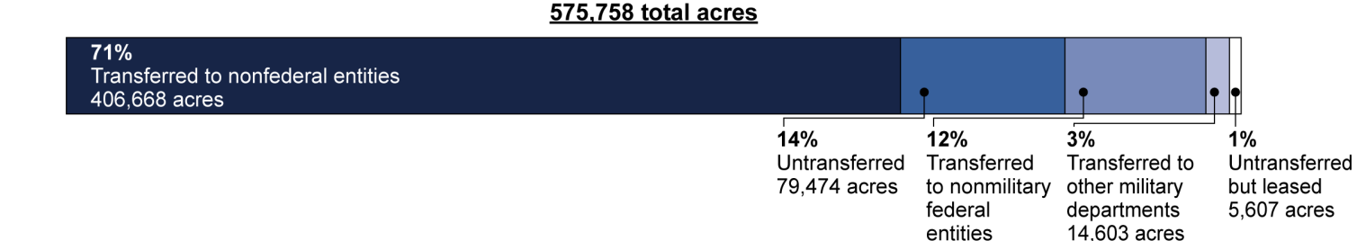
Figure 2: Disposition of Unneeded Base Realignment and Closure Acreage, as of September 30, 2015

Source: GAO analysis of Department of Defense data. | GAO-17-151