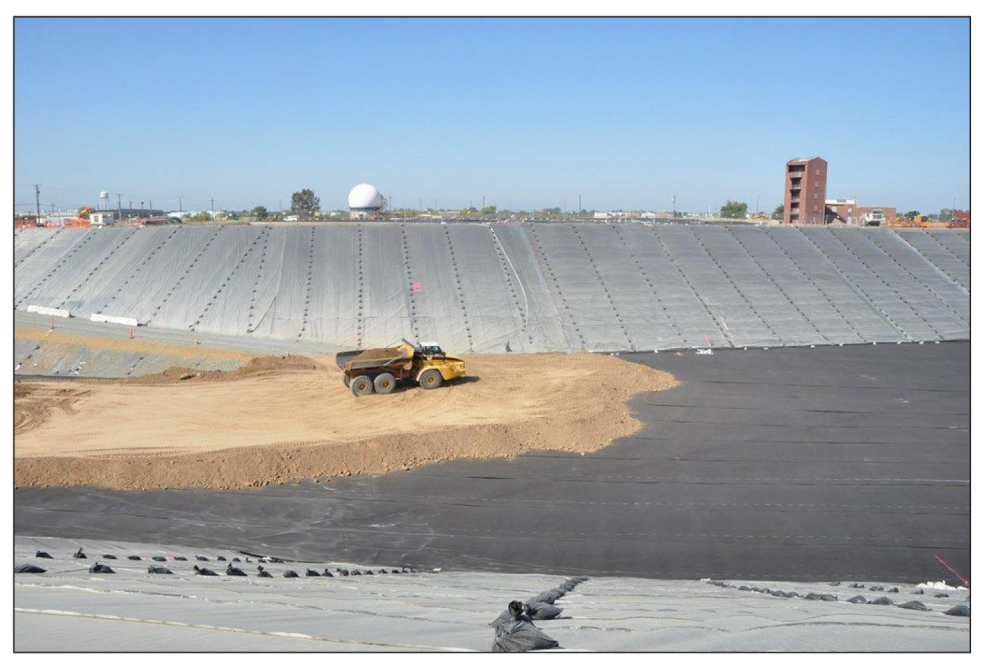
Figure 4: Consolidation Landfill at Former McClellan Air Force Base, California