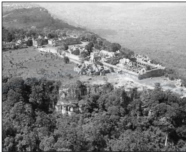
Figure 1 Preah Vihear Temple viewed from Cambodian Territory 10

While most Khmer sanctuaries are situated facing east towards the rising sun, Preah Vihear faces north towards Thailand. The temple was built to embody the mythical center of the universe Mount Meru, the home of Shiva and other Hindu gods, and its northern location was intended to denote the extent of the Khmer Empire in the ninth century. 9 The temple represented the Khmer rulers' early use of the information instrument of power by demonstrating the empire's regional influence, cultural and religious significance, and reach.